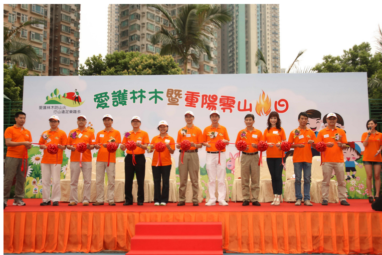
二零一零年消防處「愛護林木暨重陽零山火日」開幕禮 The Opening Ceremony of 'Zero Hill Fire Scheme' 2010

had successfully hit the target of “Zero Hill Fire” and were awarded. We were pleased to note that both the number of participating villages and the number of villages hitting the target had been increased yearly since the launching of the scheme in 2007, indicating that the scheme received recognition.