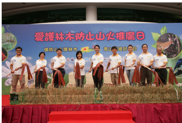
二零一一年消防處「愛護林木防止山火推廣日」開幕禮 The Opening Ceremony of 'Zero Hill Fire Scheme' 2011

their undertaking. In 2011, 573 villages had successfully hit the target of “Zero Hill Fire” and were awarded. We were pleased to note that the number of participating villages has been increased yearly since the launching of the scheme in 2007, indicating that the scheme received recognition.