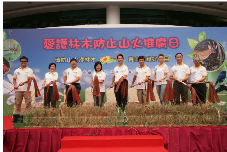
二零一一年消防處「愛護林木防止山火推廣日」開幕禮 The Opening Ceremony of 'Zero Hill Fire Scheme' 2011

their undertaking. In 2011, 573 villages had successfully hit the target of “Zero Hill Fire” and were awarded. We were pleased to note that the number of participating villages has been increased yearly since the launching of the scheme in 2007, indicating that the scheme received recognition.