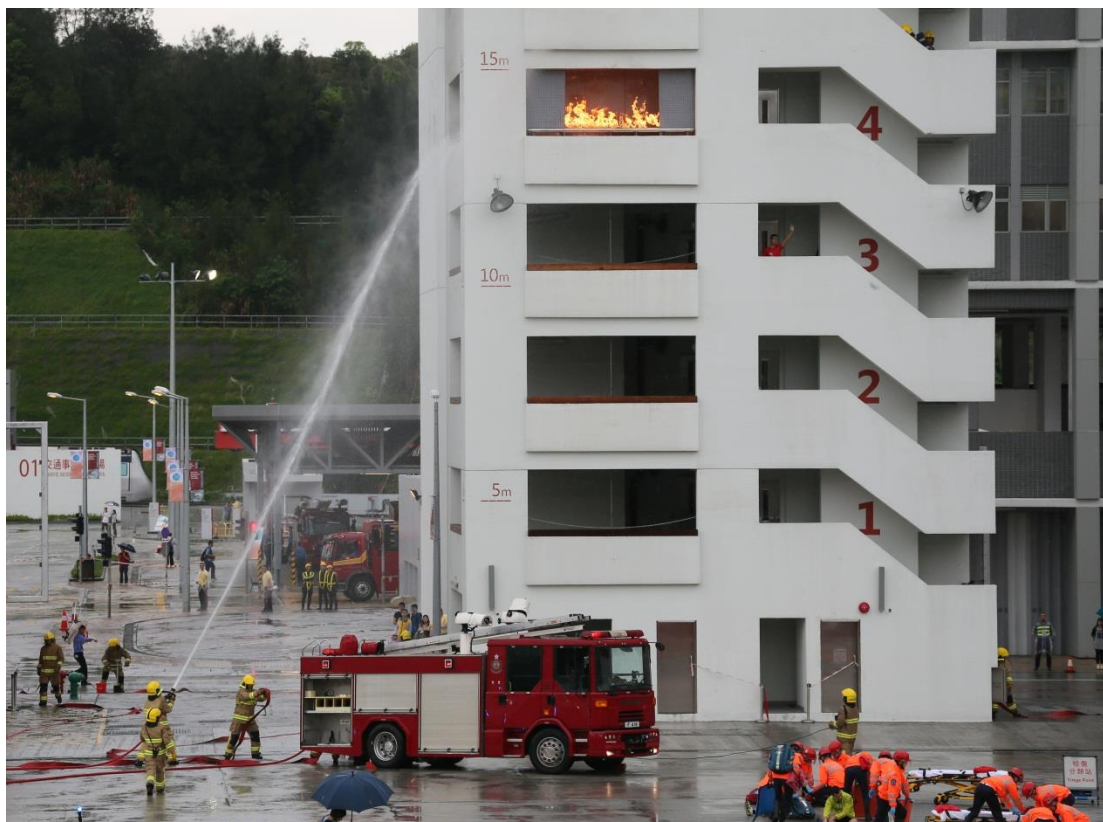
The fire, ambulance and Mobilising and Communications Group trainees demonstrate fire-fighting and rescue techniques.