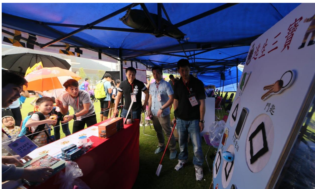
Children have a good time playing at the game booth.