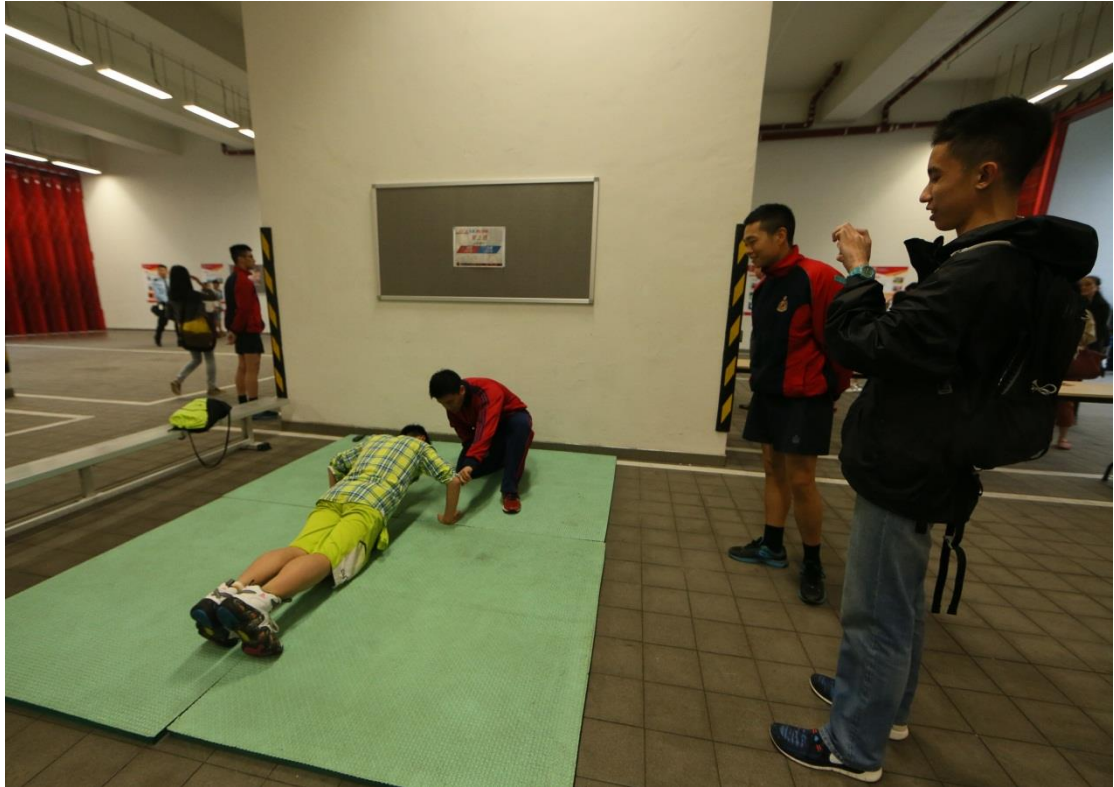
A member of the public tries out one of the job-related performance tests at the recruitment corner.