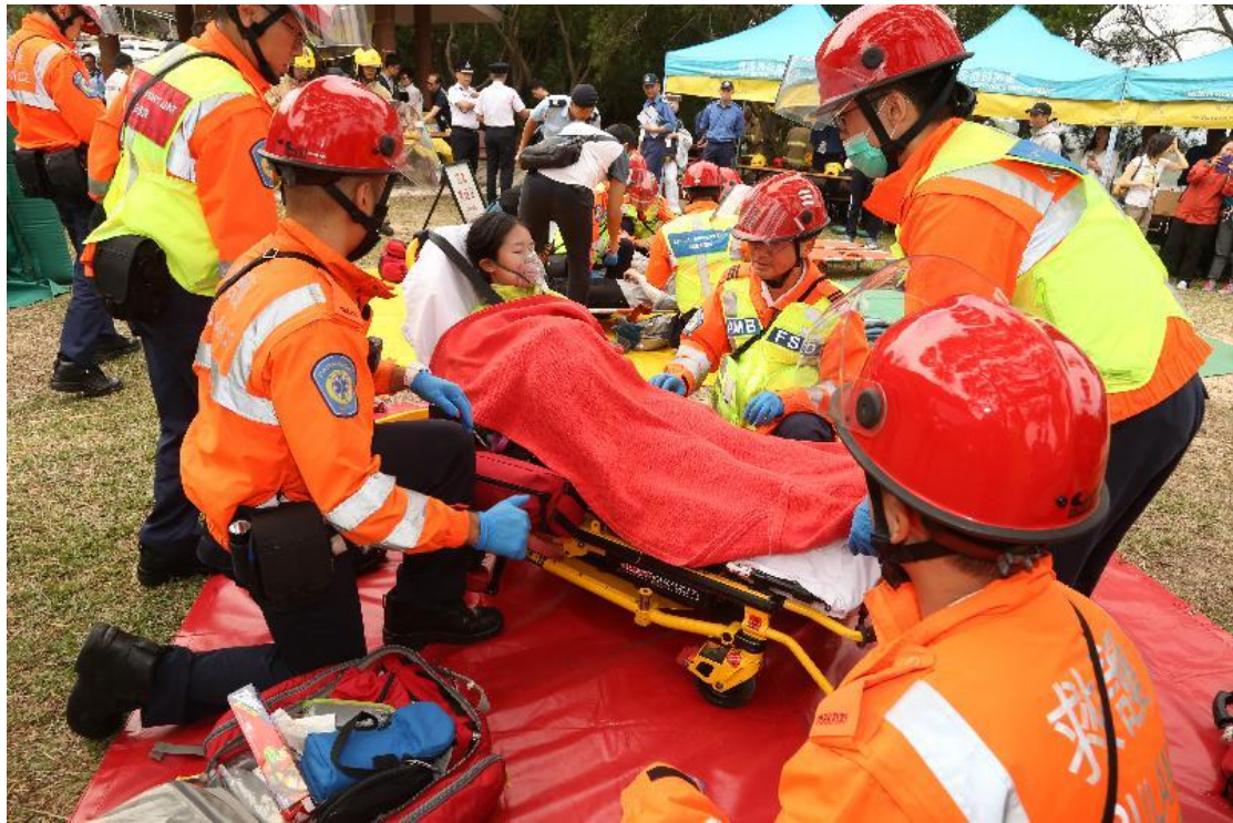
Ambulance personnel handle an injured person during an inter-departmental vegetation fire and mountain rescue operation exercise today (October 19).