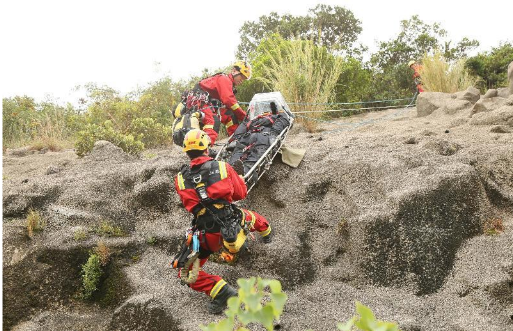
Fire Services personnel simulate the rescue of an injured person during an inter-departmental vegetation fire and mountain rescue operation exercise today (October 19).