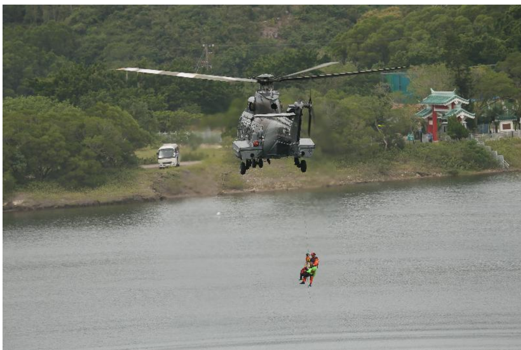
An injured person is airlifted by the Government Flying Service to a helicopter during an inter-departmental vegetation fire and mountain rescue operation exercise today (October 19).