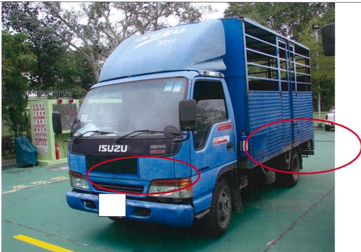
Photos showing a licensed DG Vehicle with Warning Signage removed