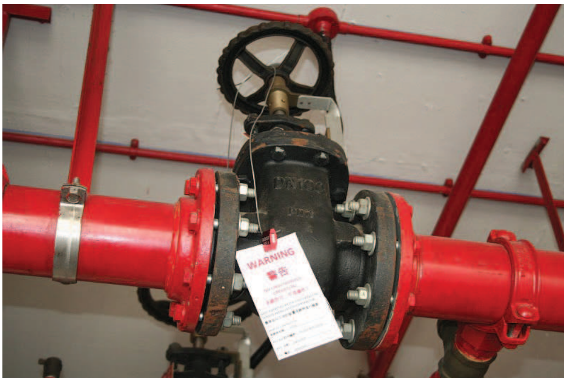
Typical Method of Securing the SSSV