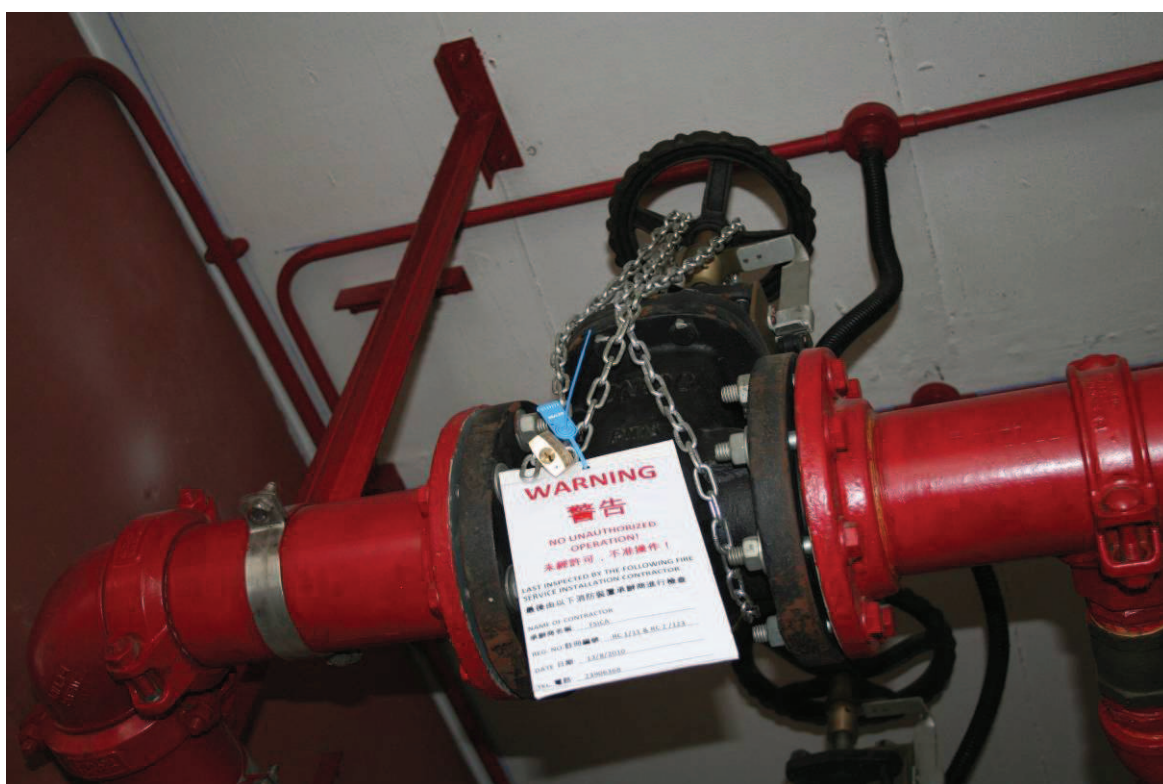
Typical Method of Securing the SSSV