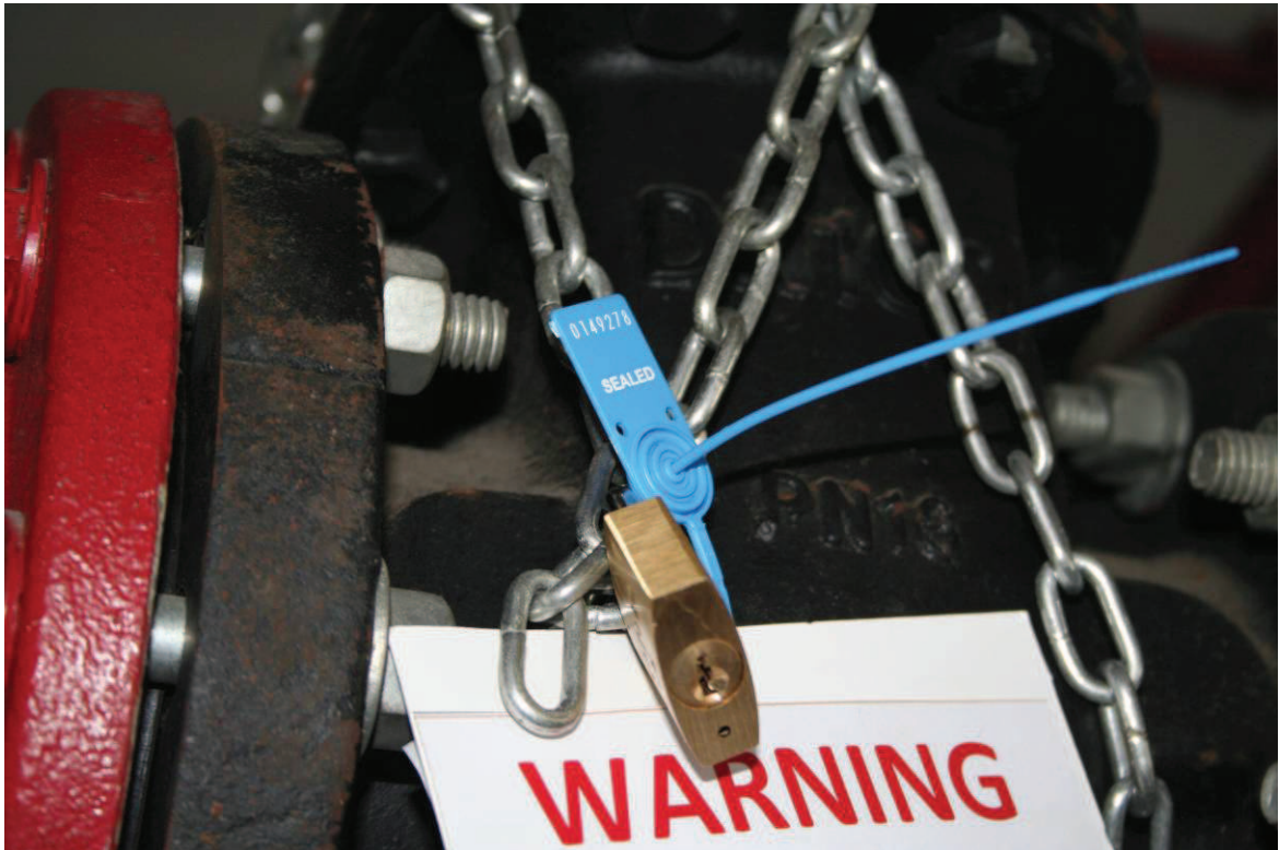
Sample of Tamper-proof Security Tag