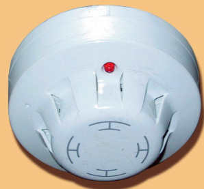
火警偵測系統 Fire Detection System