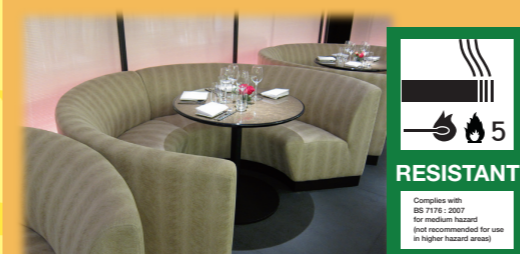
符合可燃標準的 聚氨酯乳膠 PU Foam conformed to Flammability Standard

食物環境衛生署會在收到消防處的通知後就違反 消防安全規定的持牌條件發出警告信。 FEHD will issue warning letter for breach of licensing condition due to non-compliance of FSRs upon notification by FSD.