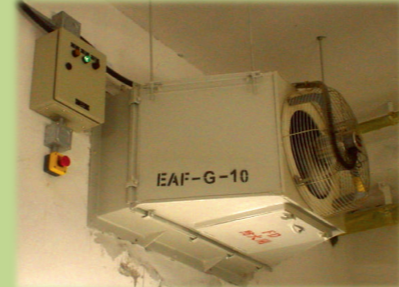
排煙系統 Smoke Extraction System