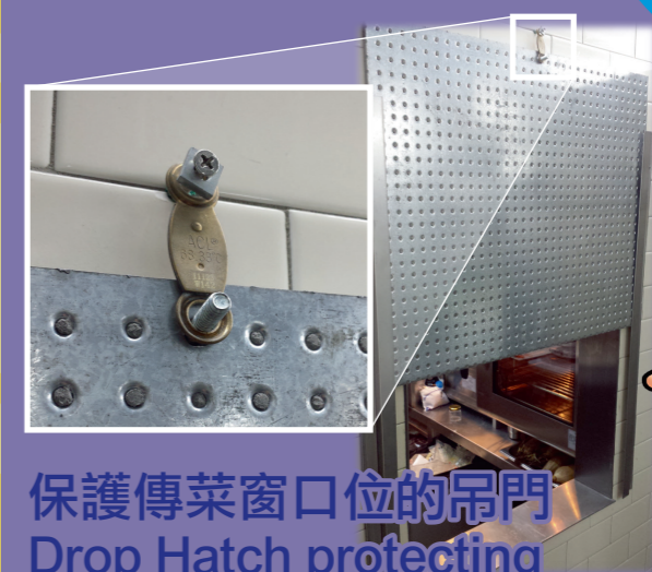
保護傳菜窗口位的吊門 Drop Hatch protecting Food Serving Opening