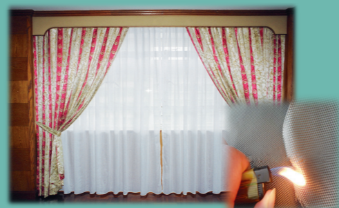
防火漆 / 溶液處理 Fire Retardant Paint / Solution Treatment