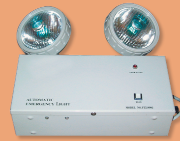
應急照明系統 Emergency Lighting