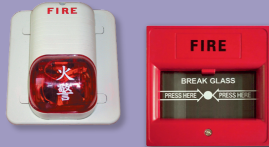
手動火警警報系統 Manual Fire Alarm System