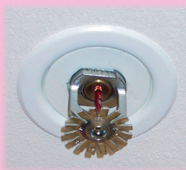
花灑系統 Sprinkler System