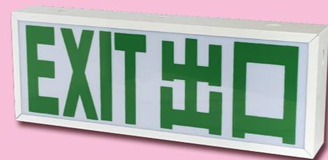
出口指示牌 Exit Sign

違反多於一項主要消防安全規定可引致食物業牌照 被暫時吊銷。 Non-compliance of more than one Major FSRs is liable to suspension of food business licence.