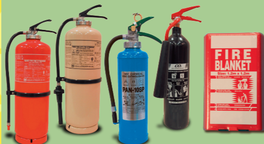
手提滅火裝備 Portable Firefighting Equipment