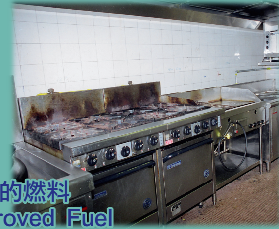
認可的燃料 Approved Fuel