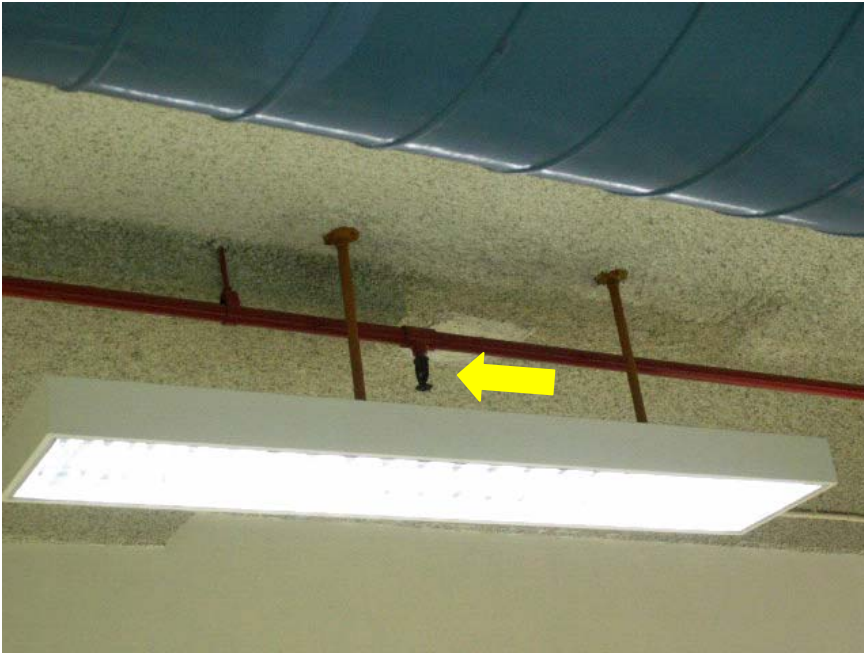
Obstruction to sprinkler head