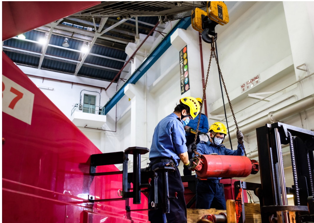
工程及运输组人员检查灭火工具和装备。 Officers of the Workshops and Transport Division inspect firefighting tools and equipment.