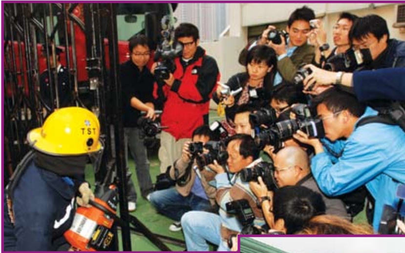
傳媒參觀消防設施 A demonstration of fire equipment for the media