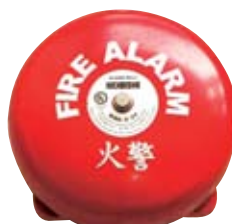
火警警鐘 Fire Alarm Bell

總部總區由一名消防總長掌管，協助處長執行規劃及管理事務，以及為各行動總區提供政策及後勤的支援。總部總區亦負責管理消防通訊中心、機場消防隊、潛水組、消防訓練學校、招聘及考試組、工程及運輸組、物料供應組、體能訓練組和福利組的運作，並處理有關新聞和宣傳的事宜。