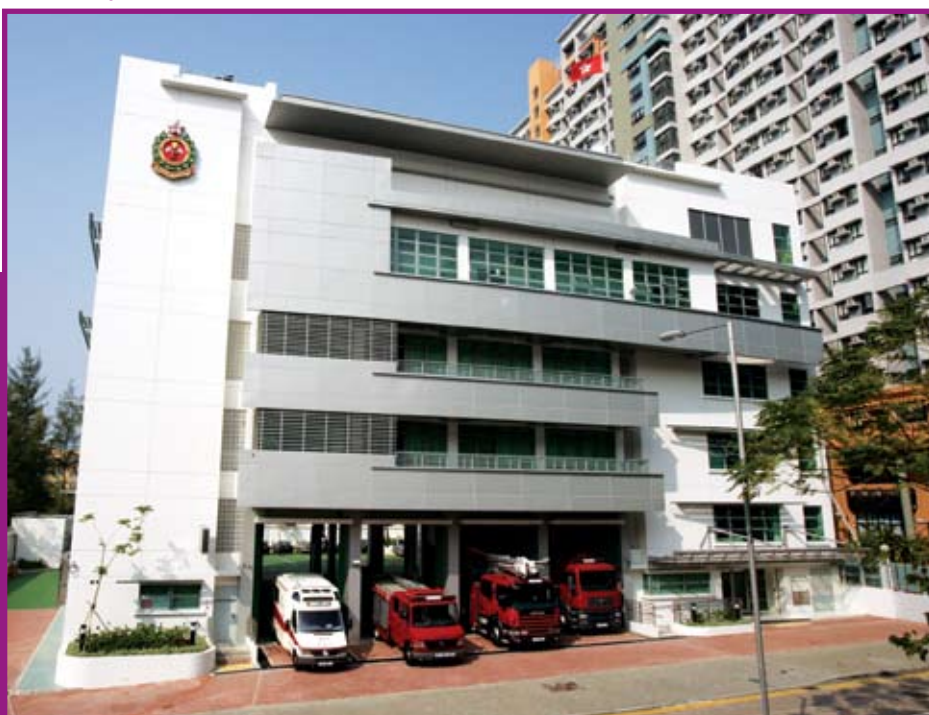
九龍塘消防局 Kowloon Tong Fire Station

The Planning Group under the Headquarters Command plans for new fire stations, ambulance depots and deployment of resources, as well as monitors the progress and construction of departmental capital projects. The Group also offers advice from an operational view on district development plans and study reports on municipal and commercial projects; evaluates fire-fighting and rescue equipment and appliances as well as oversees occupational safety and health matters.