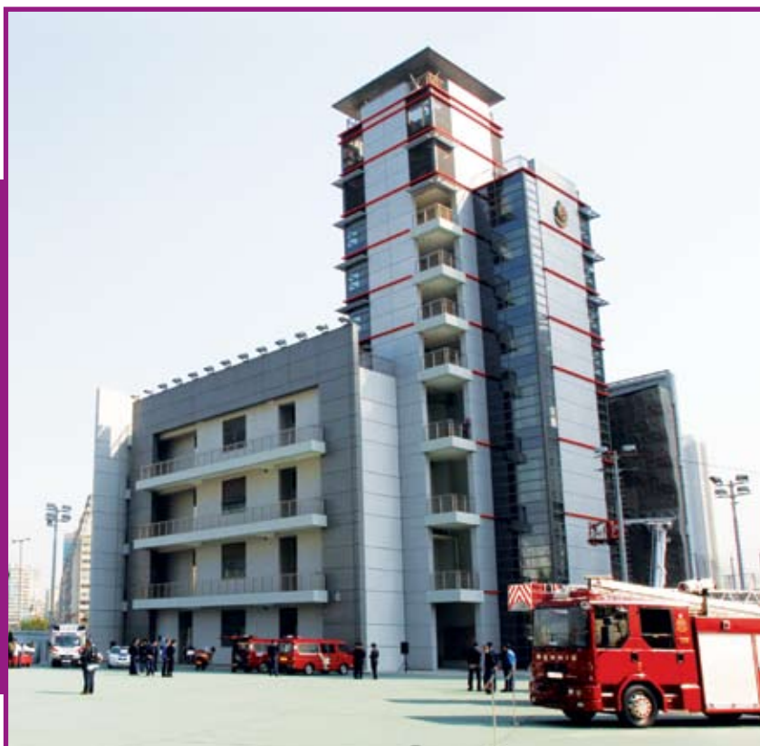
西九龍救援訓練中心 West Kowloon Rescue Training Centre

The West Kowloon Rescue Training Centre was commissioned in November 2006. The nine-storey training centre is equipped with advanced fire fighting and rescue training facilities to strengthen the tackling skills of the fire personnel in different types of fire and disaster.