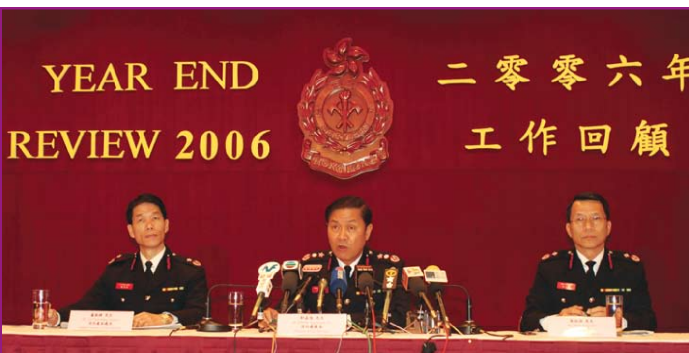
年終回顧記者會 A year-end press conference

During the year, the Unit answered a monthly average of 922 media and public enquiries, and arranged about 176 interviews and 68 news conferences/briefings for journalists on specific and general subjects relating to the Department.