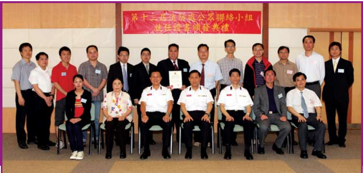
第十三屆公眾聯絡小組 The 13th Public Liaison Group

The Committee, chaired by the Deputy Chief Fire Officer (Headquarters), received six suggestions in 2006. Letters of appreciation were awarded to innovative submissions.