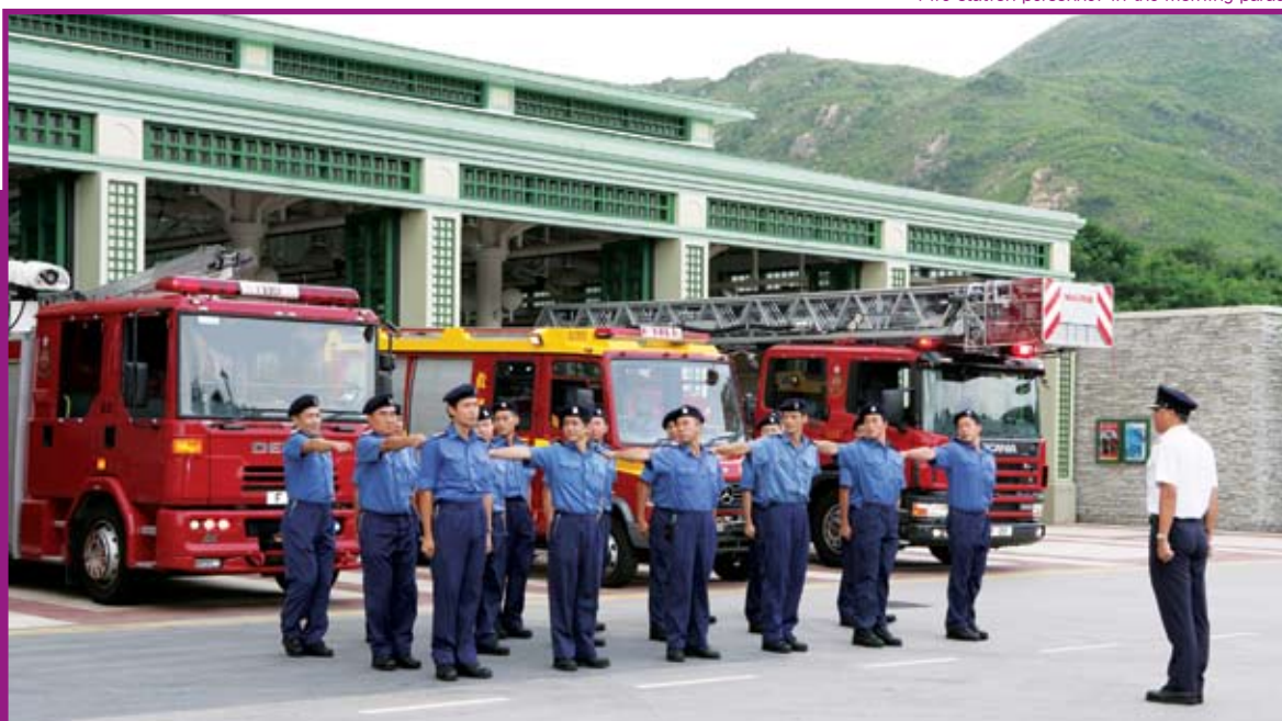
消防局人員列隊會操 Fire station personnel in the morning parade

The two Fire Protection Commands — Licensing and Certification and Fire Safety — are each headed by a Chief Fire Officer. The Licensing and Certification Command oversees licensing and enforcement work; and the Fire Safety Command deals with fire protection and fire safety matters.