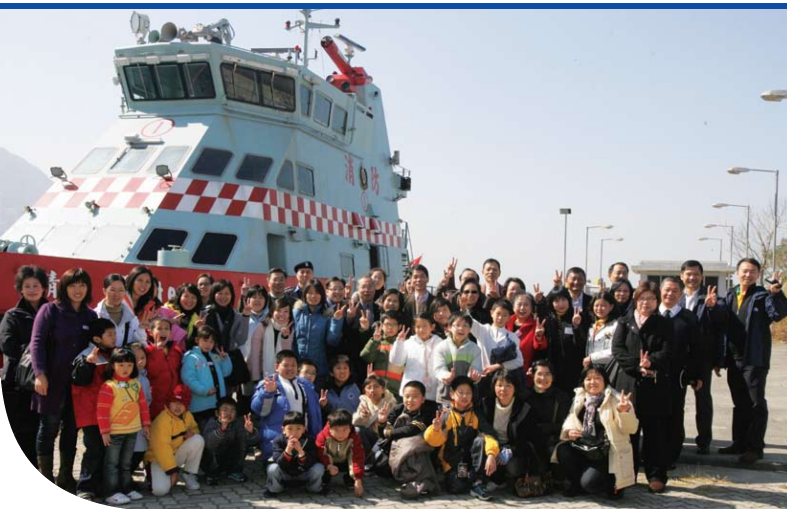
社區團體參觀滅火輪 The community groups visit a fire boat

It also works closely with local fire stations in organising fire safety talks, seminars, fire safety exhibitions and fire drills.