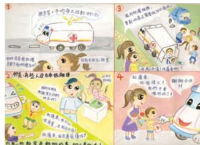
四格漫畫得獎作品 A winning entry of the 4-Panel Comic Drawing Competition