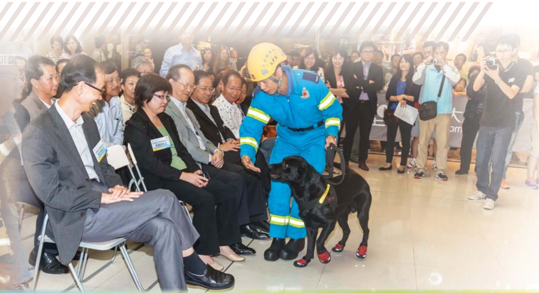
火警調查犬參與消防安全宣傳活動 A fire investigation dog participates in a fire safety publicity event