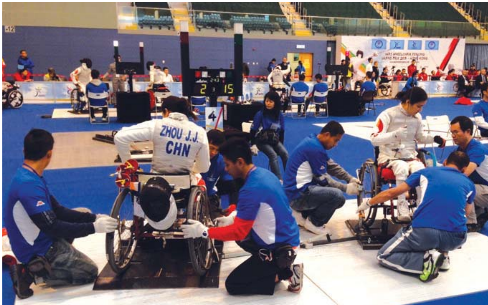
消防處義工隊人員在 IWAS香港輪椅劍擊 格蘭披治賽提供協助 Members of FSD Volunteer Team provide volunteer service at the International Wheelchair and Amputee Sports Federation (IWAS) Wheelchair Fencing Grand Prix