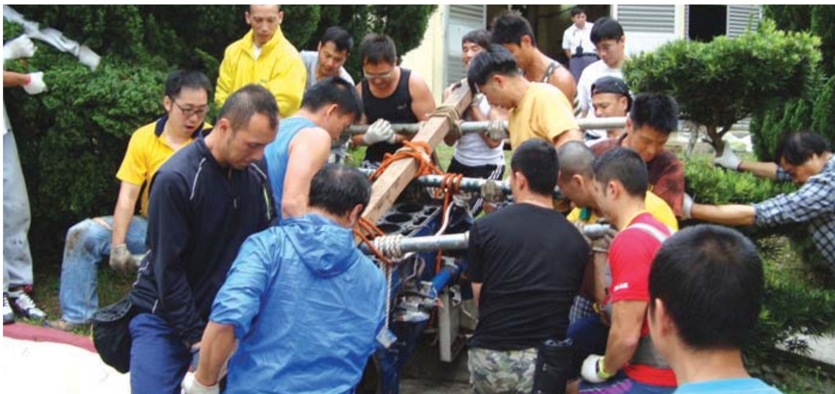
消防處義工隊人員 在西貢基督教互愛 中心提供服務 Members of FSD Volunteer Team provide services for Wu Oi Christian Centre in Sai Kung

The FSD Volunteer Team has over 900 members comprising uniformed and civilian staff members to serve the community and help people in need. In 2013, more than 17 700 service hours have been contributed by the volunteers during their off-duty period. The volunteers actively take part in voluntary activities organised by non-governmental organisations and charities.