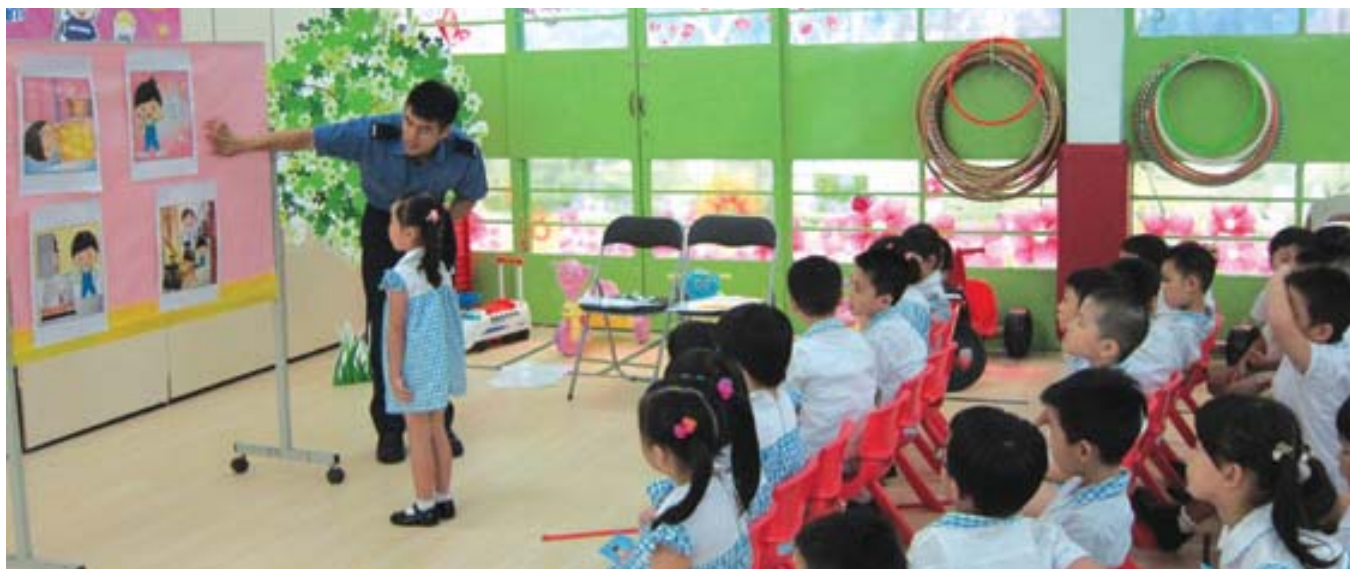
消防安全教育員向 幼稚園學童傳遞消 防安全信息 A Fire Safety Educator disseminates fire safety message to pre-school children

Up to the end of 2013, 1 269 fire safety talks were delivered with 80 417 children attended. In addition, 1 124 questionnaires were received from those kindergartens upon completion of the training. Responses from staff of the kindergartens towards this programme are positive.