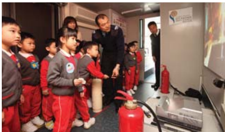
幼兒在消防安全教育巴士內學習應對火警的方法 Children learn in the Fire Safety Education Bus how to react in case of fire

The FSEB is deployed to attend roving exhibitions at various primary and secondary schools, community centres, private and public housing estates, fire safety carnivals, evacuation drills and other fire safety activities. Feedbacks are very encouraging and most of the visitors said that they could apprehend how to react in case of fire and learn the evacuation technique after the tour. Up to the end of 2013, FSEB has been arranged to attend 479 exhibitions with 50 943 visitors.