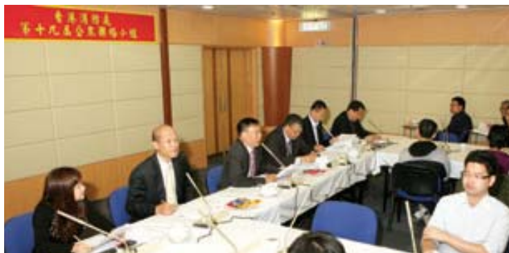
消防處公眾聯絡小組舉行會議 A meeting of the FSD Public Liaison Group is in progress

In 2013, a total of four Ambulance Service Roving Exhibitions were organised by the Ambulance Command. They were organised in collaboration with the Hospital Authority, Auxiliary Medical Service and St. John Ambulance Association. The exhibitions aim at educating the general public on proper use of emergency ambulance service.