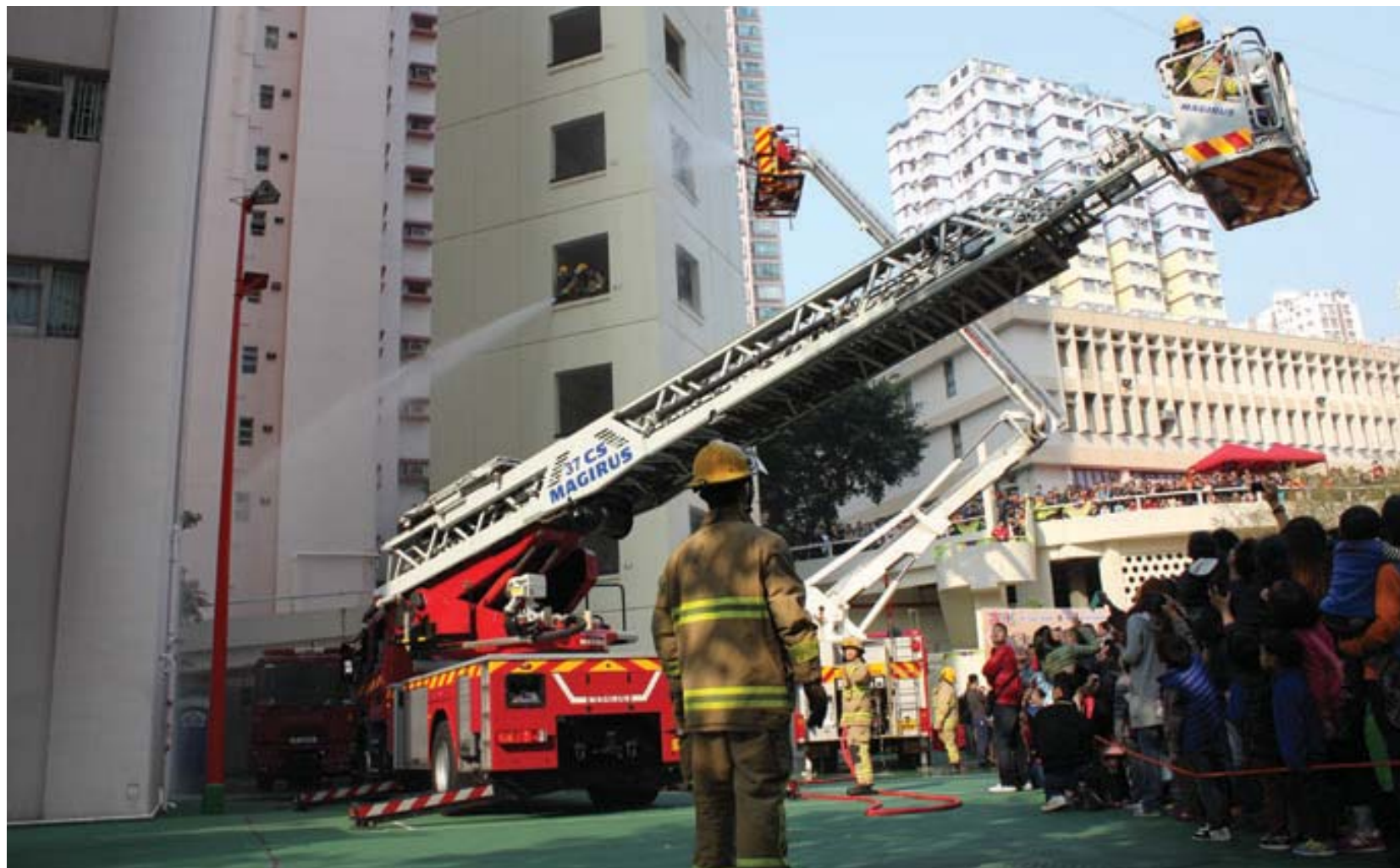
黃大仙消防局開放日 Open day of Wong Tai Sin Fire Station