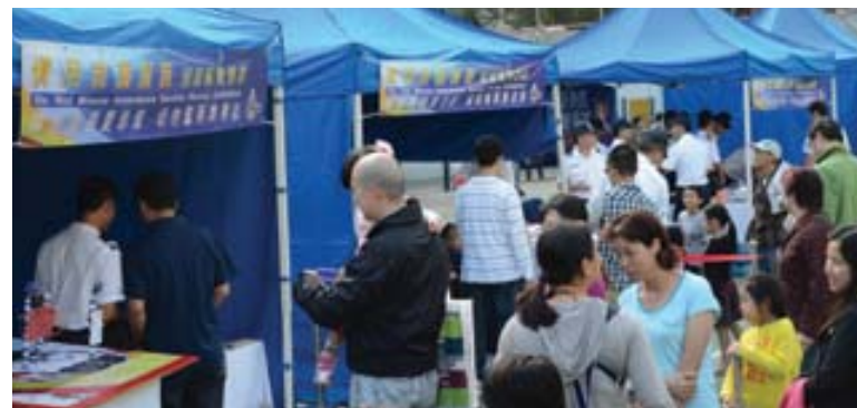
救護服務巡迴展覽吸引不少市民參觀 The Ambulance Service Roving Exhibition is well-received by the public