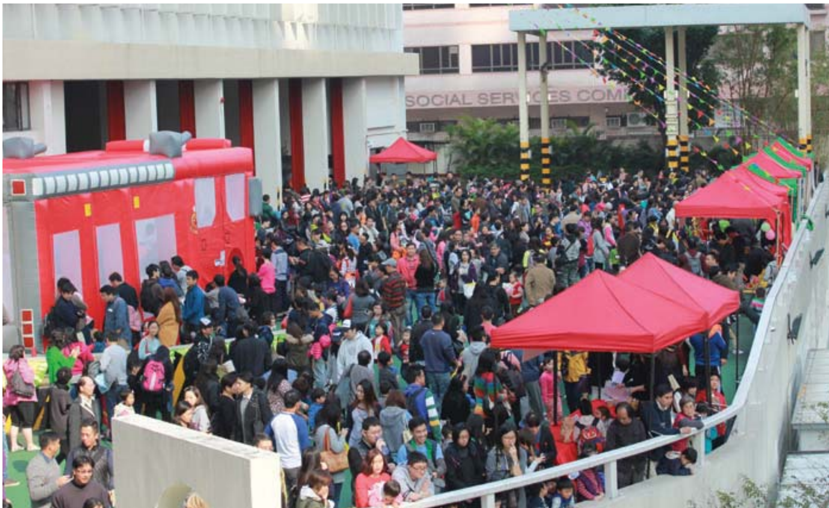
市民踴躍參加消防局 開放日活動 The open day of fire station is well-received by the public