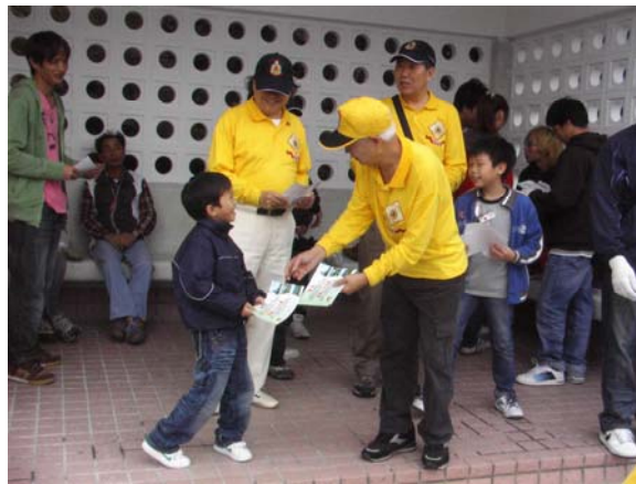
消防屬員向掃墓的市民派發防止山火的宣傳單張 FSD staff Distributing leaflets on Hillfire Prevention to gravesweepers

their undertaking. In 2008, 445 villages had successfully hit the target of “Zero Hill Fire” and were awarded.