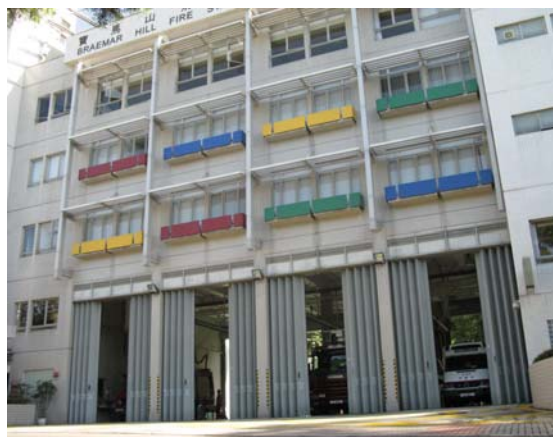
Folding gates at Fire Station installed with noise mitigation measure

☆ to reduce the noise generated from the operation of folding doors, variable speed drivers had been installed as a mitigation measure on all the existing automatic folding doors. Moreover, Planning Group of this Department had also included such device in the design of all new fire stations and ambulance depots. With the installation of such device, this Department had received no complaint in 2008 regarding the noise caused by automatic folding doors.