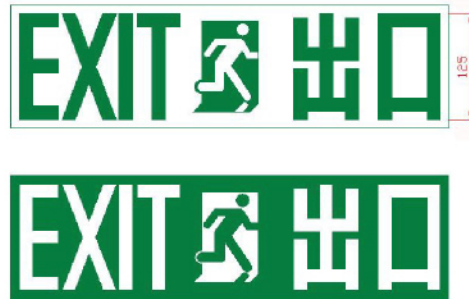
Figure 2 – Combined Graphical Symbol and Characters Exit Sign