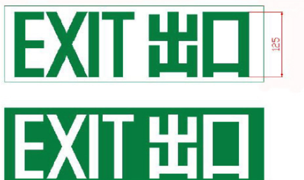
Figure 1 – Current Exit Sign