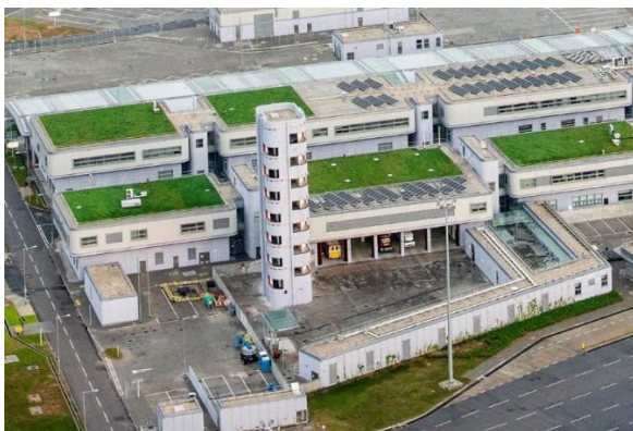
Green Roofs on Hong Kong-Zhuhai-Macao Bridge Fire Station cum Ambulance Depot

The Hong Kong-Zhuhai-Macao Bridge Fire Station cum Ambulance Depot is another FS facility showcasing green building concepts. The design of the buildings, coupled with specially selected construction materials, helps maximise the penetration of natural daylight indoors and hence, brings down power consumption from the lighting system. The adoption of occupancy sensors, which automatically adjust the brightness of the interior lights, goes a step further in optimising power use. The green roofs and green walls are delicately designed and constructed to provide additional thermal insulation while enhancing the aesthetic appeal of the buildings. Installed at the rooftops are solar photovoltaic panels to promote better use of renewable energy.