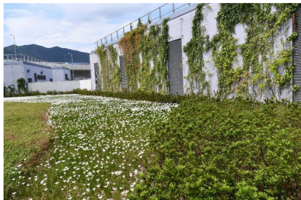
Green Walls at Hong Kong-Zhuhai-Macao Bridge Fire Station cum Ambulance Depot