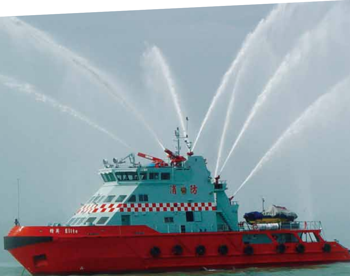
滅火輪「精英號」 Fireboat "Elite"

To enhance the search and rescue capabilities of the fireboats in restricted visibility at sea, long range night vision equipment would be introduced into the fireboat fleet.