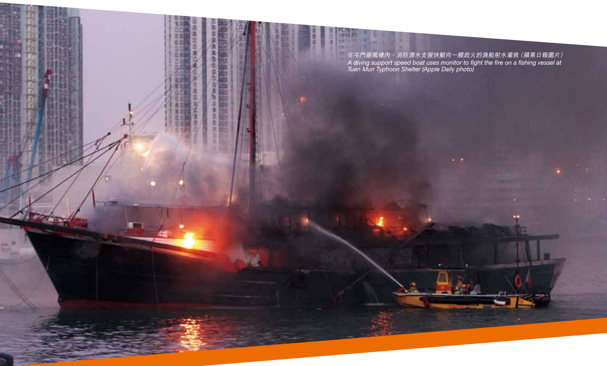
在屯門避風塘內，消防潛水支援快艇向一艘起火的漁船射水灌救 A diving support speed boat uses monitor to fight the fire on a fishing vessel at Tuen Mun Typhoon Shelter

On October 27, a fire broke out at a village house at 492, Kam Wing Villa in Pat Heung, Yuen Long. Two people were self-evacuated while one woman, who was overcome by smoke, and two unconscious boys inside a bedroom were sent to hospital. The two boys were certified dead at hospital.