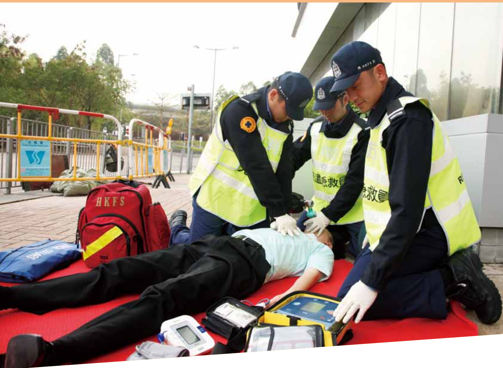
前線消防人員提供先遣急救服務 Frontline fire personnel provide first responder service