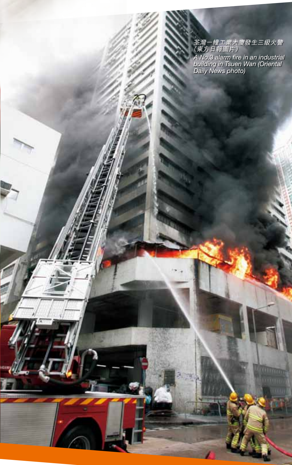
荃灣一幢工業大廈發生三級火警 A No.3 alarm fire in an industrial building in Tsuen Wan