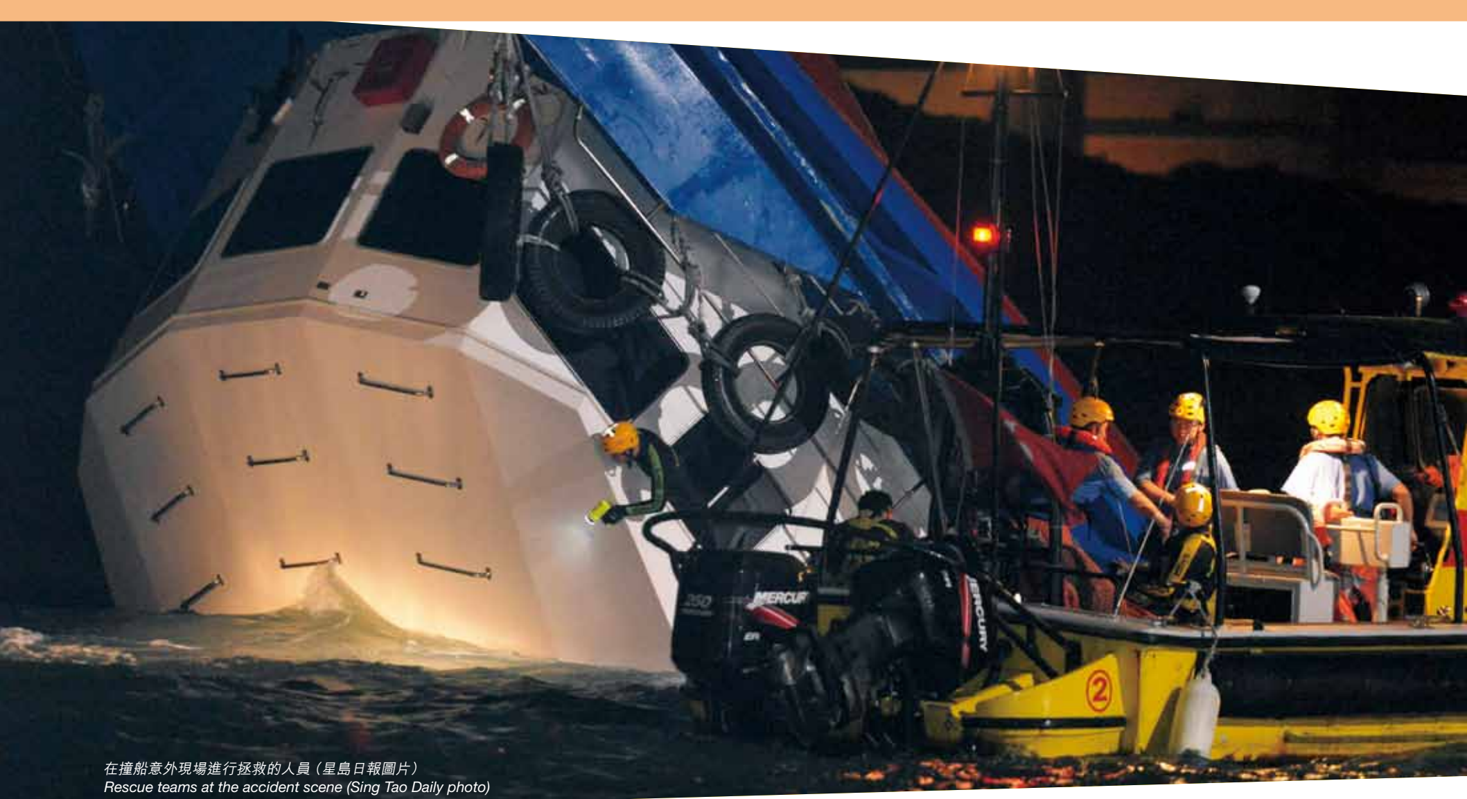
在撞船意外現場進行拯救的人員 Rescue teams at the accident scene