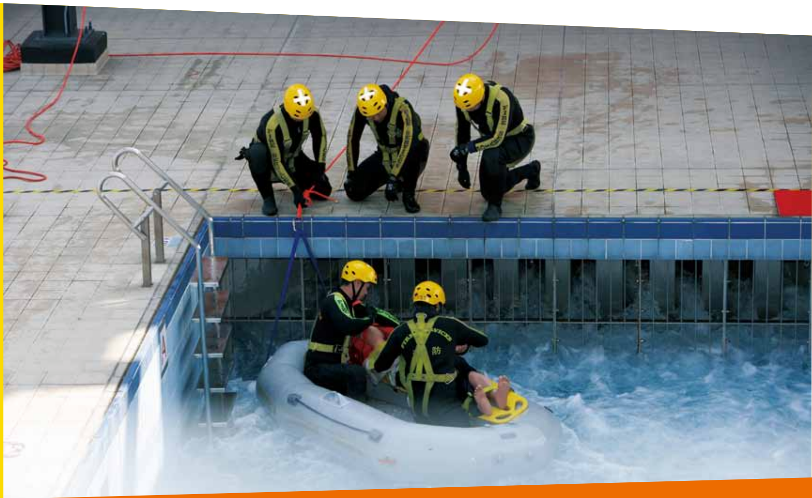
潛水人員在消防處潛水基地進行訓練 Divers receive training at the FSD Diving Base

The FSD Diving Base on Stonecutters Island is equipped with a range of advanced professional and training facilities to enhance the search and rescue skills of Service divers. It also provides swift water rescue training for frontline fire and ambulance personnel. In 2012, a total of 271 members have completed the training.