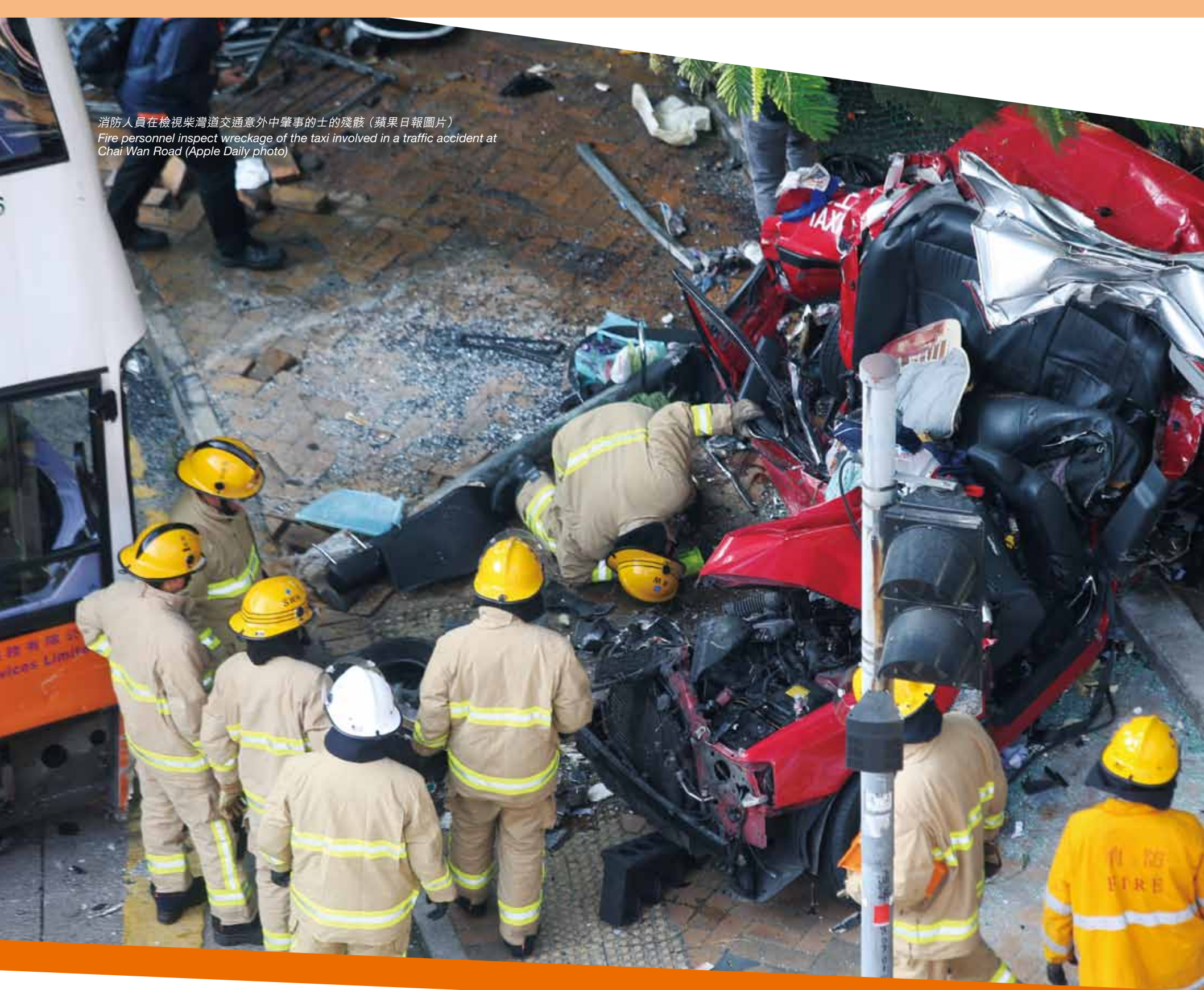
消防人員在檢視柴灣道交通意外中肇事的士的殘骸 Fire personnel inspect wreckage of the taxi involved in a traffic accident at Chai Wan Road