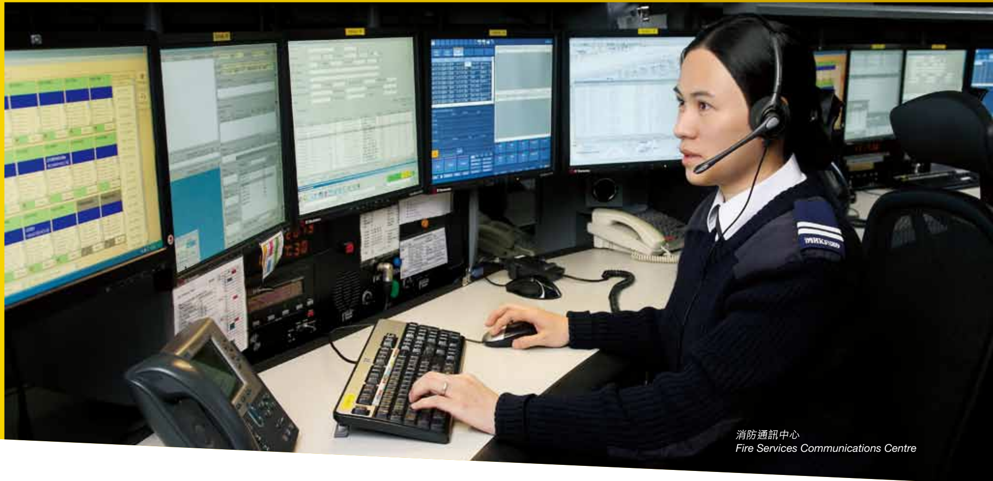
消防通訊中心 Fire Services Communications Centre