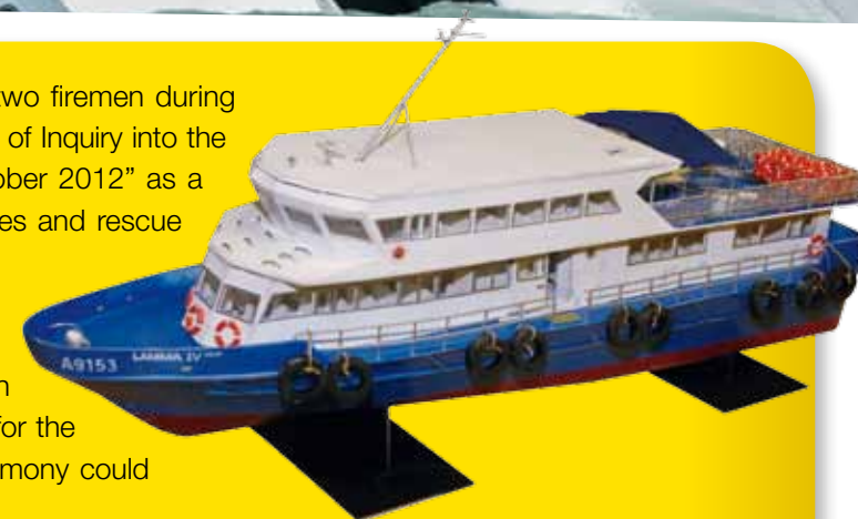
消防人員製作的「南丫四號」模型 The scale model of “Lamma IV” made by FSD personnel