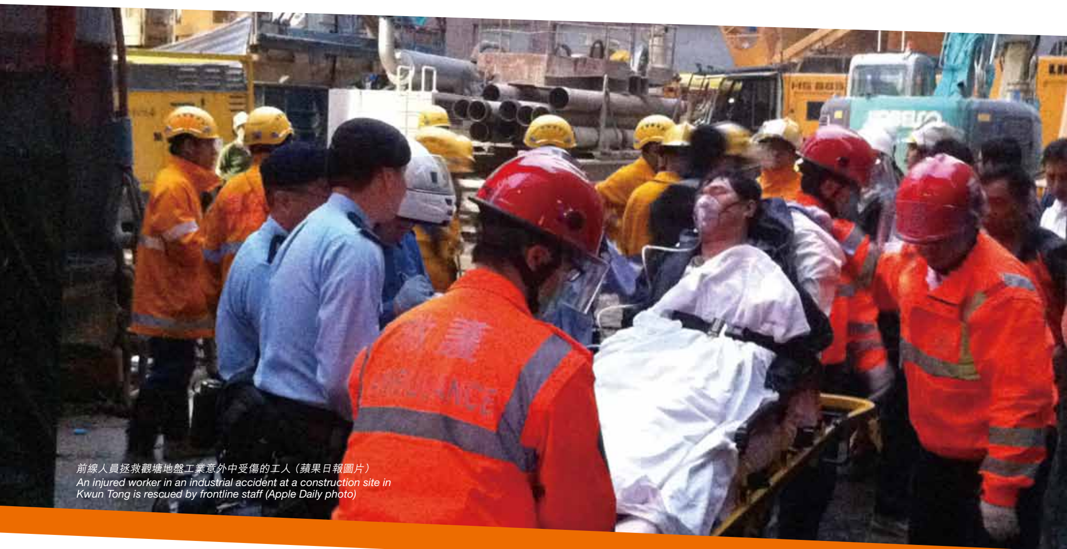
前線人員拯救觀塘地盤工業意外中受傷的工人 An injured worker in an industrial accident at a construction site in Kwun Tong is rescued by frontline staff

During the year, the Ambulance Command responded to 727 300 calls, representing an average of 1 987 calls per day. A total of 654 371 patients, or a daily average of 1 788 were handled.