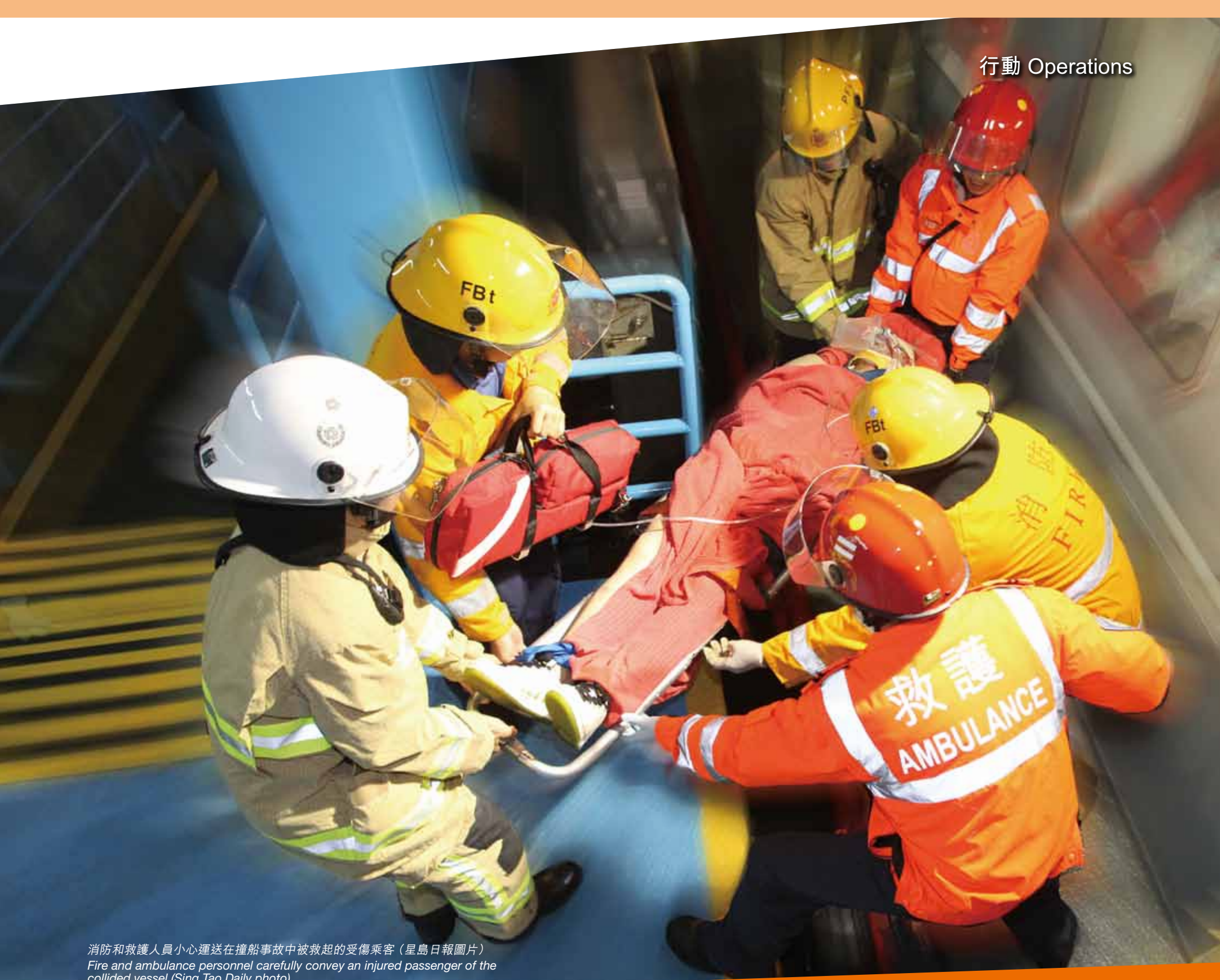
消防和救護人員小心運送在撞船事故中被救起的受傷乘客 Fire and ambulance personnel carefully convey an injured passenger of the collided vessel