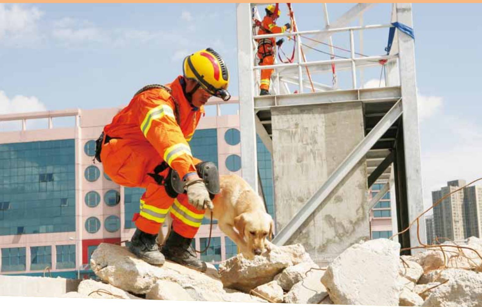
坍塌搜救專隊和搜救犬 A USAR Team member and a search dog