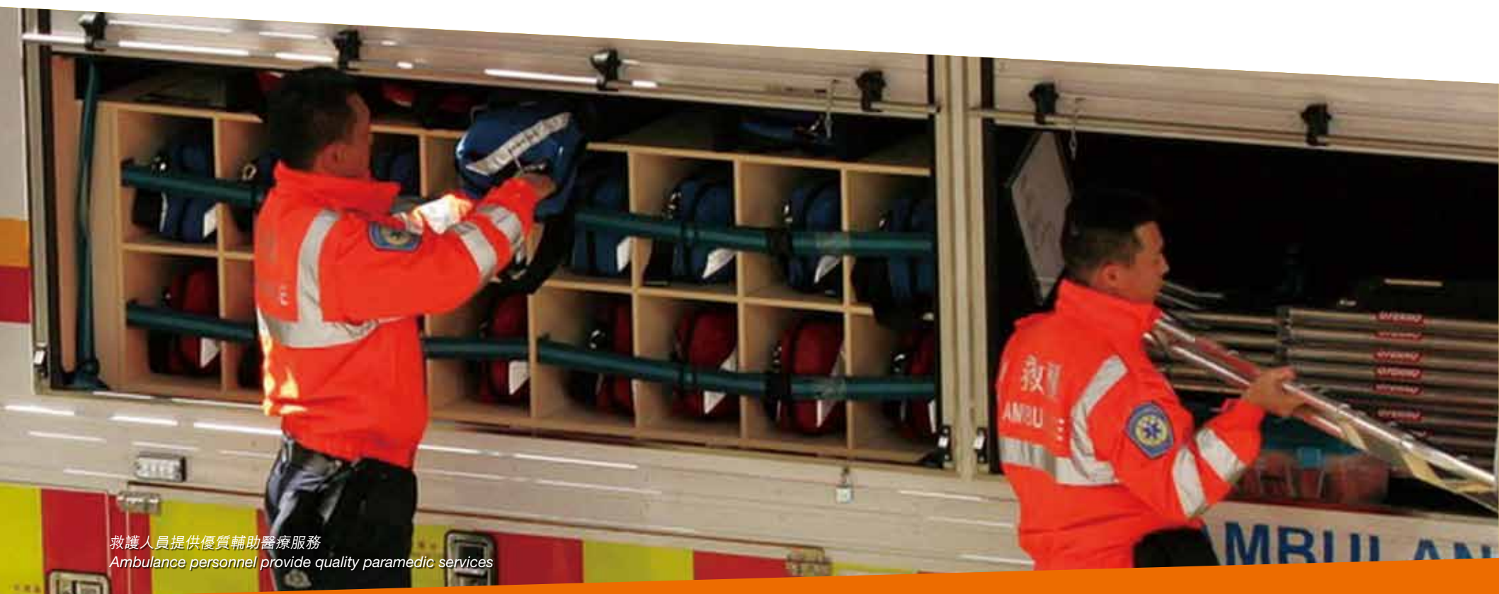
救護人員提供優質輔助醫療服務 Ambulance personnel provide quality paramedic services

The public in general support the principles and broad framework that ambulance response should be prioritised in accordance with the degree of urgency of the calls. A dedicated team has been set up to look into the feasibility of its implementation.