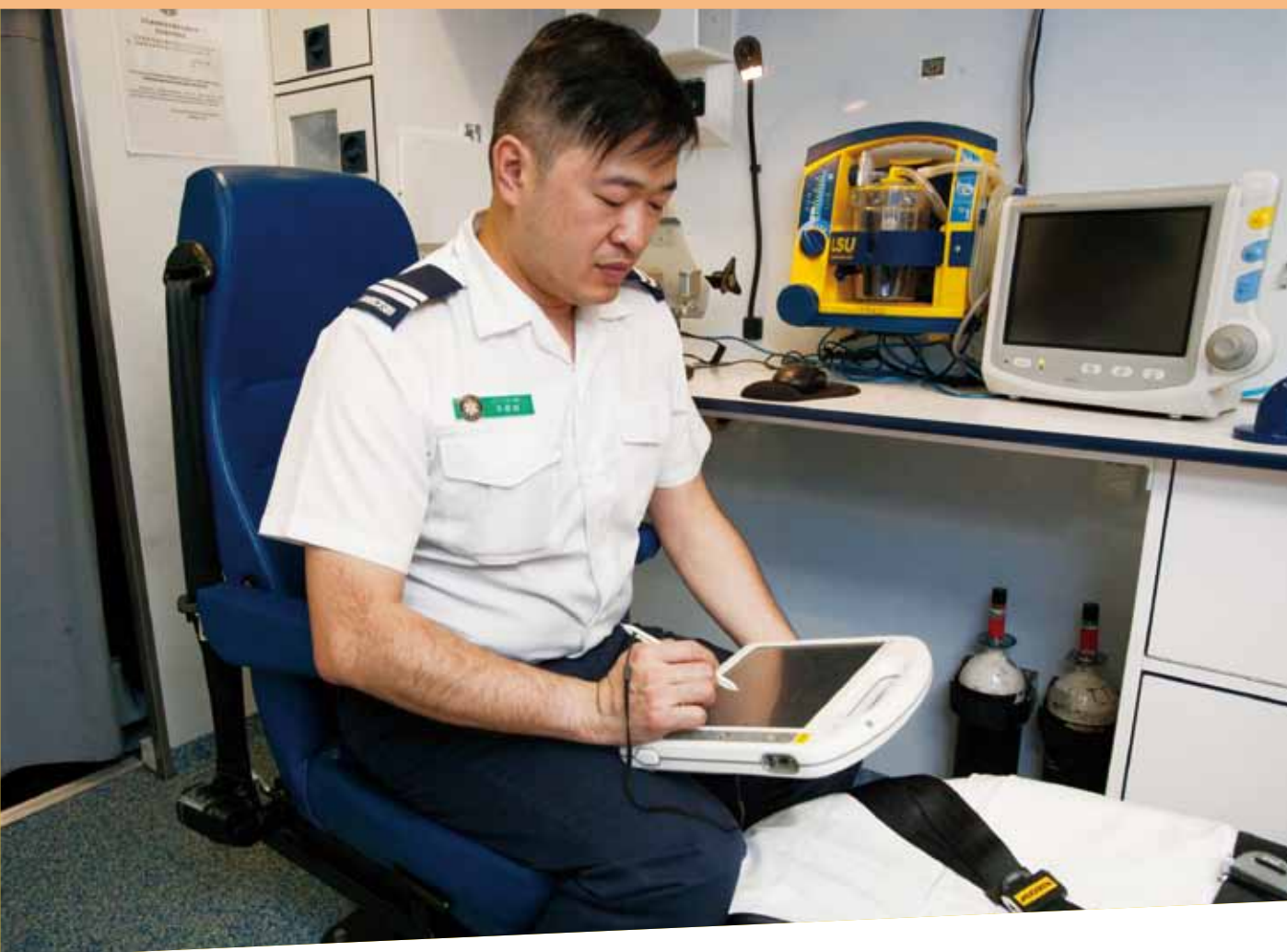
救護人員在救護車內輸入出勤記錄資料 An ambulance officer inputs journey record data inside an ambulance

在緊急救護車及急救醫療電單車當值的救護人員，全部均具備輔助醫療資格。車上亦備有自動心臟去顫器，以及應付糖尿病、休克、心臟病、氣促、抽搐和過量服食藥物等情況的指定藥品。