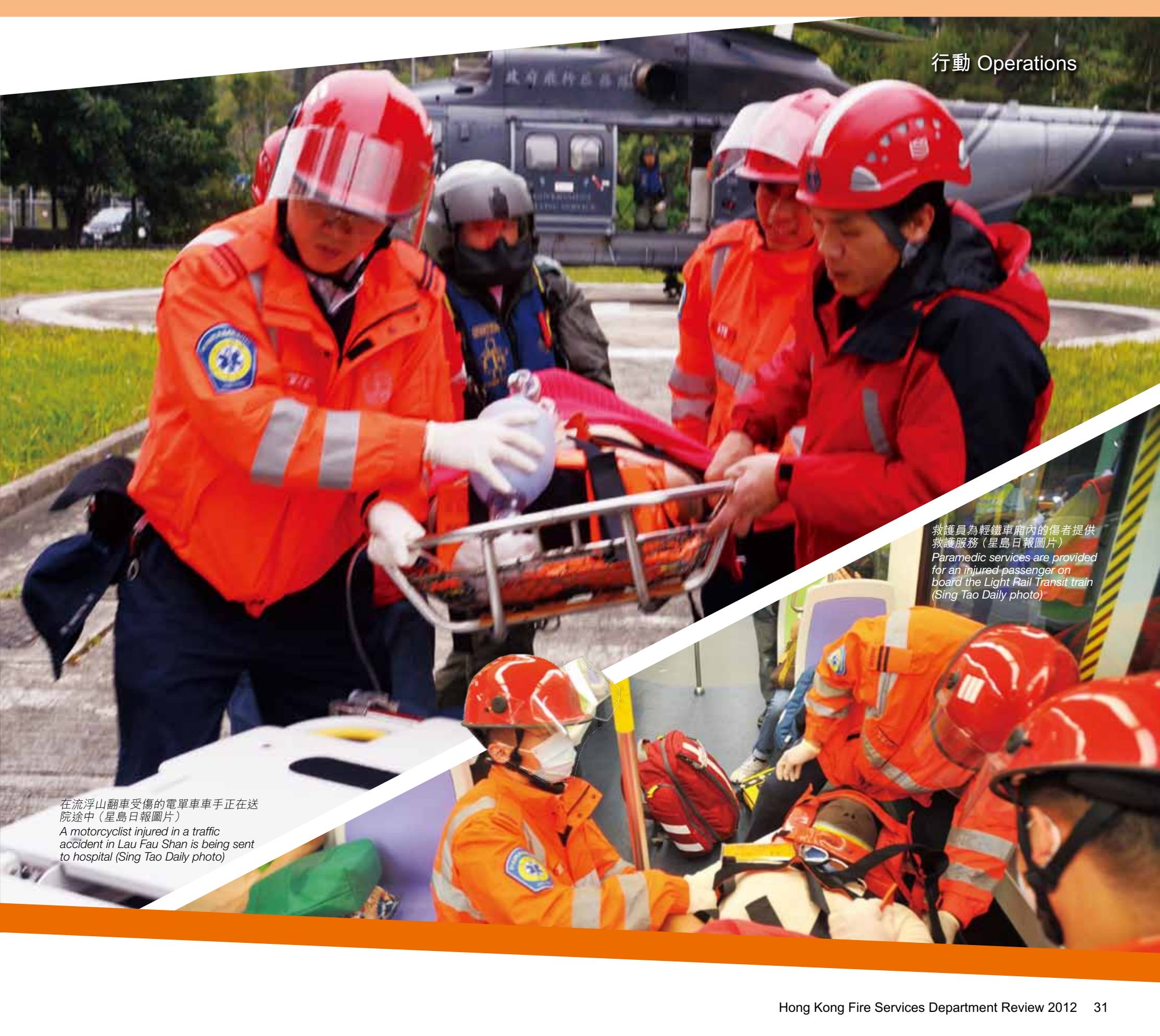
在流浮山翻車受傷的電單車車手正在送院途中 A motorcyclist injured in a traffic accident in Lau Fau Shan is being sent to hospital