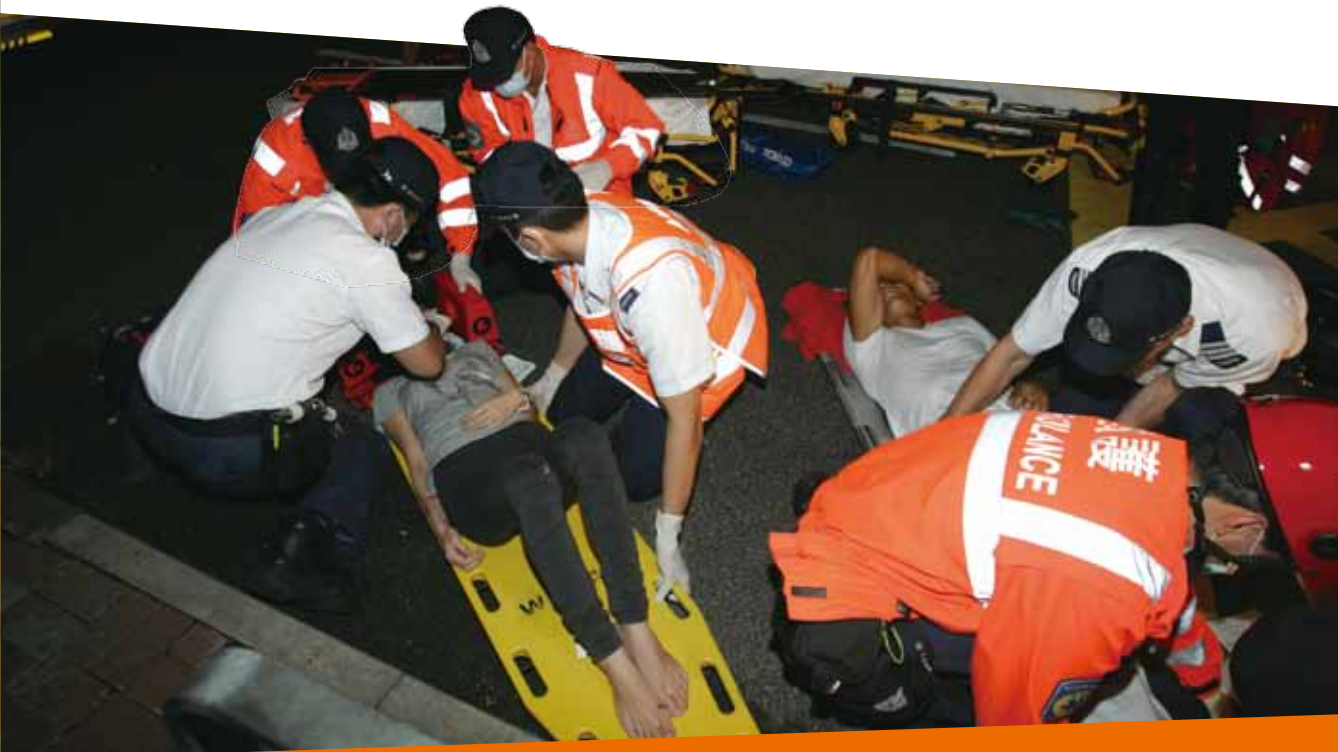
救護人員為旺角交通意外中的傷者進行急救 Ambulance personnel provide paramedic services to patients in a traffic accident in Mong Kok

On November 27, three double decker buses were involved in a traffic accident at the junction of Fleming Road and Johnston Road, Wan Chai. Two injured persons trapped inside the upper deck of a bus were extricated. A total of 50 injured people on the buses were conveyed to hospitals for further treatment.