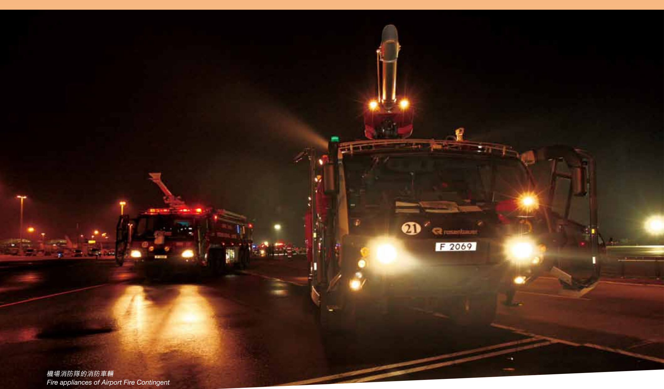
機場消防隊的消防車輛 Fire appliances of Airport Fire Contingent