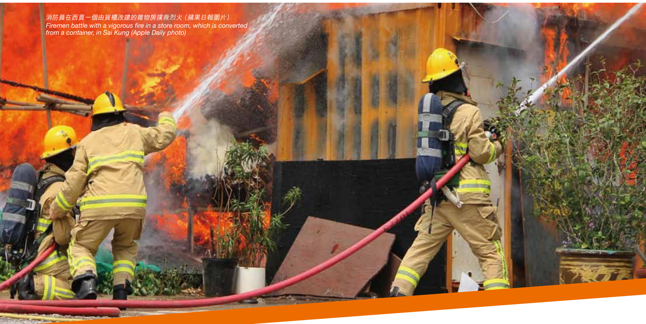
消防員在西貢一個由貨櫃改建的雜物房撲救烈火 Firemen battle with a vigorous fire in a store room, which is converted from a container, in Sai Kung

On April 21, a No.3 alarm fire occurred at a hotel at 23 Oil Street, North Point. Fire and smoke first started at an LED display wall on the roof of the hotel and then spread to various locations of the hotel. Ten hotel guests and staff were rescued and six of them sustained injuries. Of them, one woman felt unwell and was conveyed to hospital. Another 840 hotel guests and staff were evacuated with the assistance of the hotel staff.