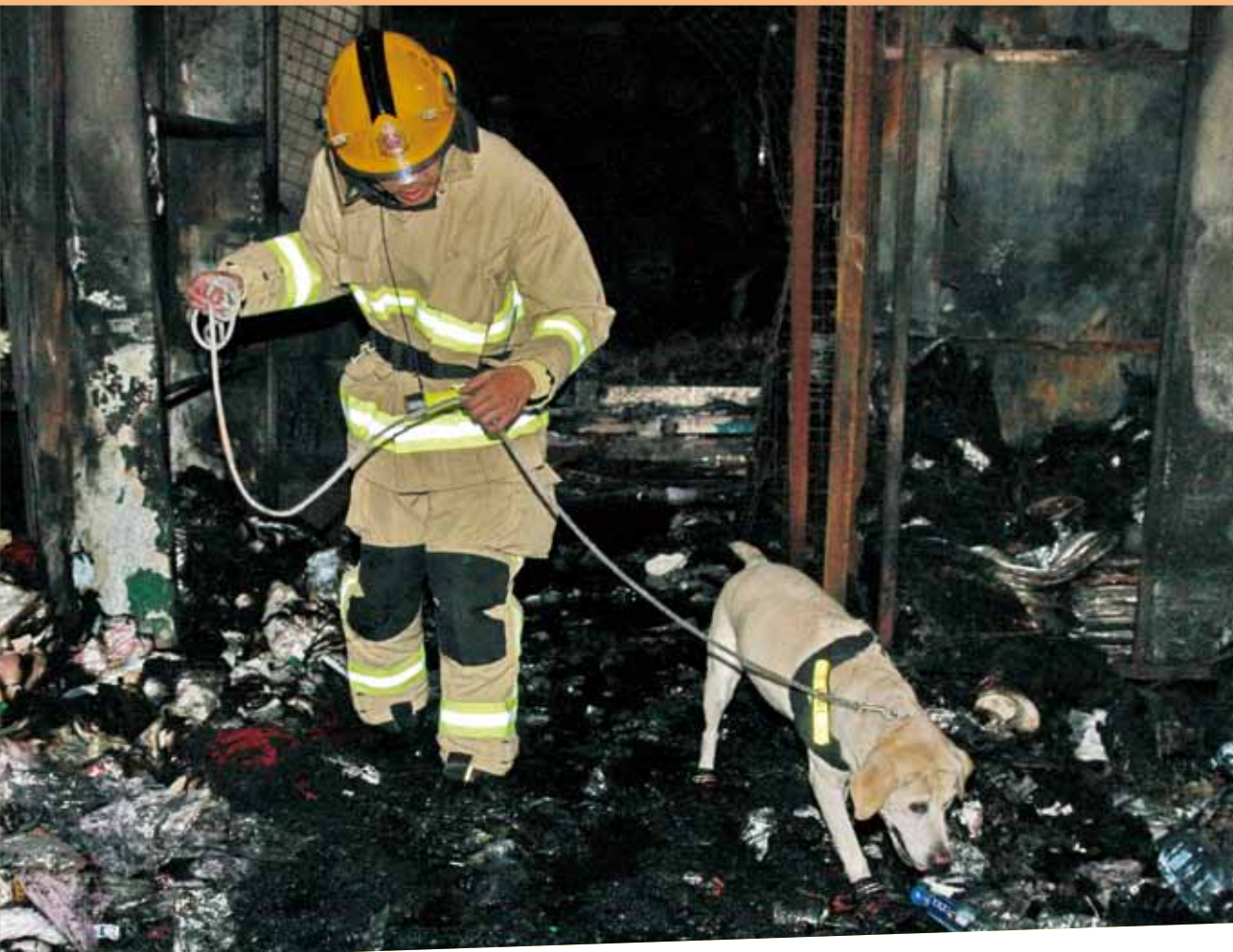
火警調查犬於火警現場協助確定是否有助燃劑 A Fire Investigation Dog helps to determine if there are accelerants in a fire scene