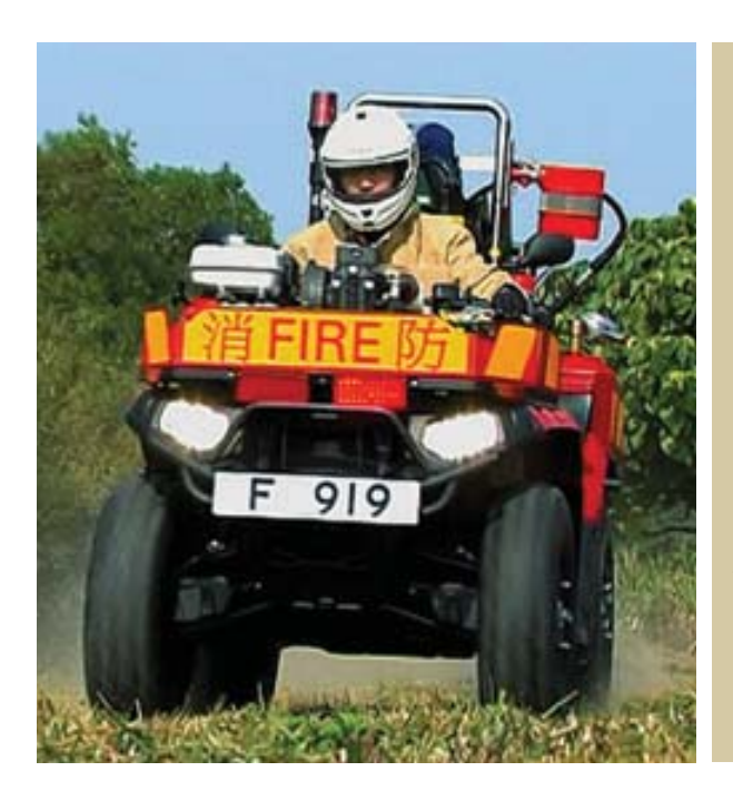
迷你消防車可於郊區狹窄而崎嶇的路面行駛,展開滅火救援行動The Mini Fire Truck can travel on narrow and rugged roads in suburban areas to carry out firefighting and rescue operations

The newly purchased Mini Fire Truck is a 4-wheel all-terrain vehicle which can travel on a narrow, steep and rugged road in a suburban district. Apart from basic firefighting and rescue equipment, the vehicle is equipped with a newly designed "Firexpress System" with a firefighting pump driven by an internal combustion engine. It can obtain water either from a built-in water tank or external water sources (fire hydrant supply or pumping open water) and is capable of extinguishing various types of fire by selecting water or mixed foam. Fireman driving the truck can quickly arrive at fire scene to carry out firefighting and rescue operation.