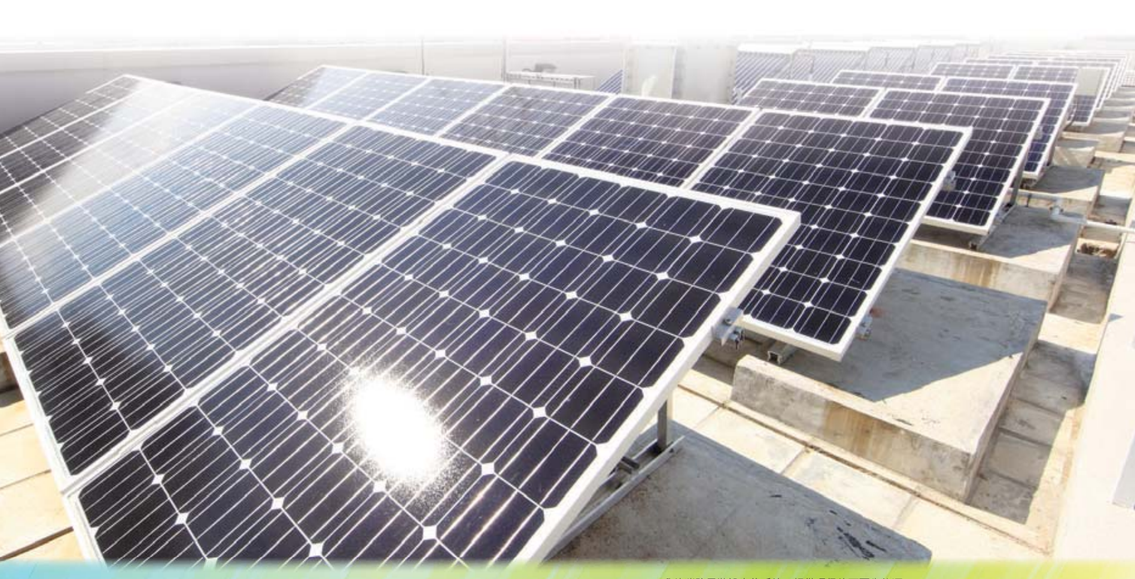
啟德消防局裝設光伏系統,提供環保的可再生能源 A photovoltaic system is installed in the Kai Tak Fire Station to provide renewable energy