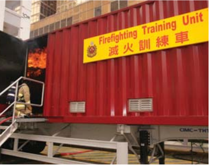
減火訓練車將派駐在不同消防局,為消防人員提供滅火訓練 The Firefighting Training Unit will be deployed to different fire stations for firefighting training