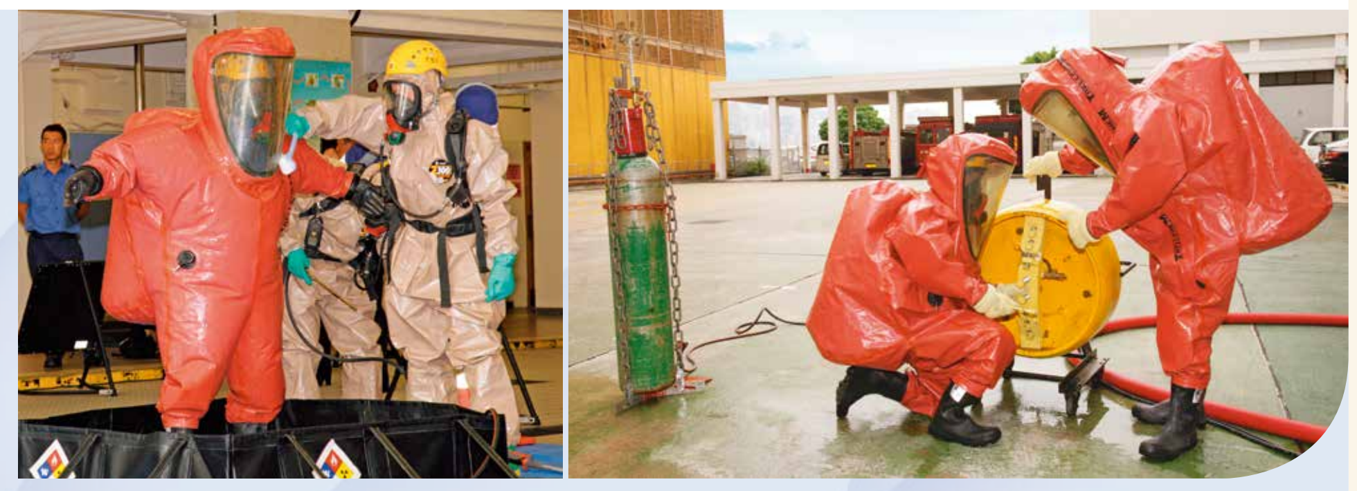
危害物质专队示范洗消程序(左图)及处理模拟化学品泄漏事故(右图)。 The HazMat Team demonstrating the decontamination procedure (left) and the handling of a simulated chemical leakage incident (right).

To further enhance the professionalism and response capability, the HazMat Team members are required to attend a revalidation course on a five-yearly basis and the Department will keep sending officers to attend the HazMat Programme organised by Illinois Fire Service Institute (IFSI), University of Illinois, the United States of America. In 2014, a total of four officers received the HazMat training in the IFSI.