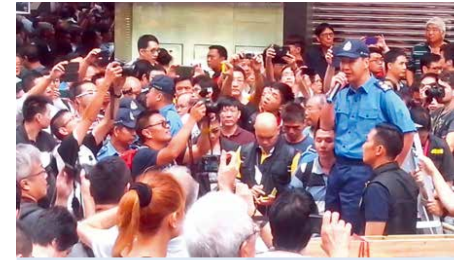
压力辅导组成员劝喻集结人士撤走路障。 Members of the Stress Counselling Team persuading the crowds to remove the barricades.

消防处派出来自处内压力辅 导组的成员,联同警方的谈 判专家到铜锣湾及旺角的占 领区,尝试劝喻集结人士撤 走路障。压力辅导组成员亦 向在场人士讲解堵塞道路对 灭火及救援行动的影响,并 呼吁受影响地区楼宇内的居 民,注意防火及熟识大厦的 逃生途径。