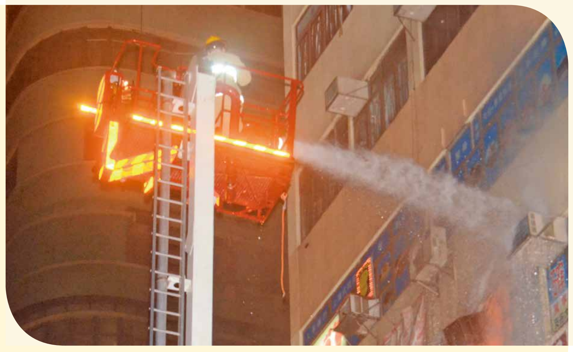
在油压升降台上的消防员灌救在旺角发生的火灾(星岛日报图片)。 A fireman on a hydraulic platform fighting a blaze in Mong Kok (Sing Tao Daily photo).