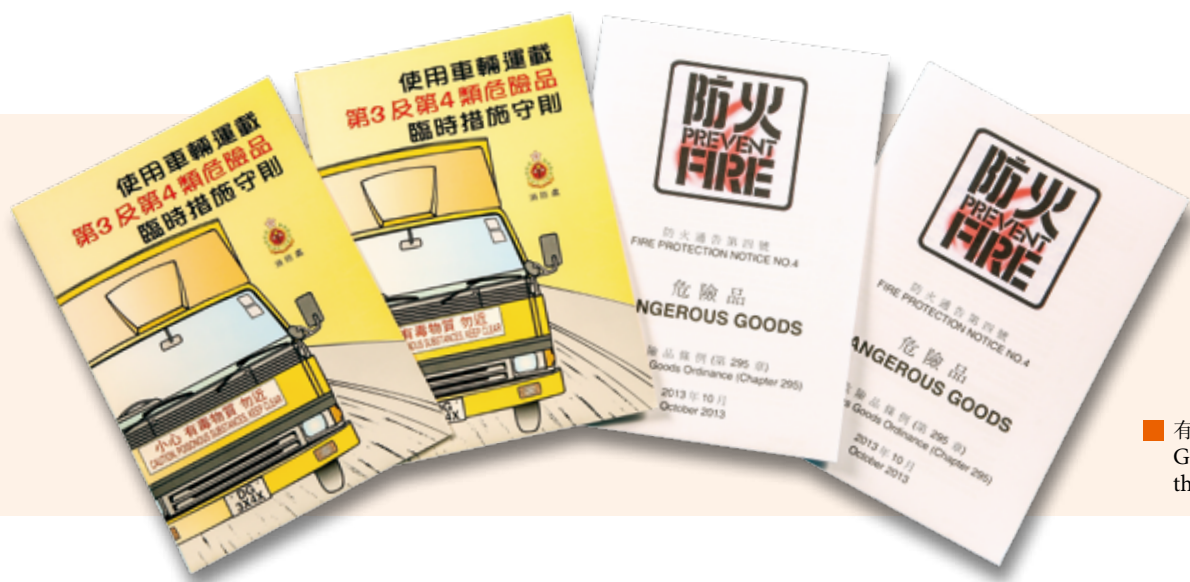
有關《危險品條例》的業務守則(左)及防火通告。 Guideline and fire protection notice related to the Dangerous Goods Ordinance.

The Policy Division administers and reviews legislation and licensing policies, formulates procedural instructions and guidelines on fire protection matters, co-ordinates resources reviews and matters related to potentially hazardous installations and examines associated risk assessment reports, issues and updates various Codes of Practice related to the Dangerous Goods Ordinance and subsidiary legislation, prepares replies to questions/queries raised by the Legislative Council, District Councils and the public, and researches and approves fire service installations, portable firefighting equipment and gas cylinders. It manages the Fire Services Dangerous Goods Stores in Pok Fu Lam Fire Station, Tsim Sha Tsui Fire Station and Sha Tin Fire Station and maintains proper inventory of the seized dangerous goods therein. It also handles legal and prosecution matters and arranges law enforcement training for Fire Services members.