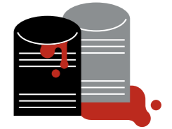
非法燃油轉注巡查 Anti-illicit fuelling activities inspections