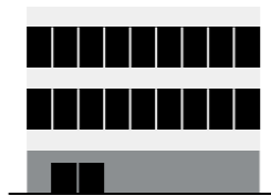
舊式住用和綜合用途建築物消防安全巡查 Inspections of old-style domestic and composite buildings