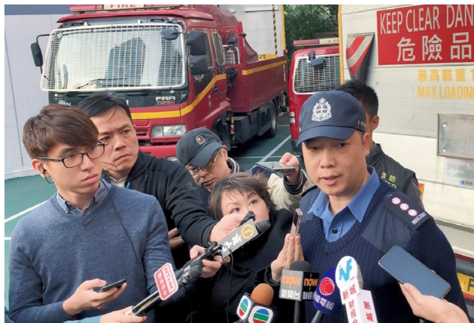
a. 危險品課人員就針對過量儲存危險品的突擊巡查行動會見傳媒。 An officer of the Dangerous Goods Division briefs the media on a surprise operation to combat over-storage of dangerous goods.

Established under the Dangerous Goods Ordinance, Dangerous Goods Regulations and Fire Services (Fire Hazard Abatement) Regulation, the Anti-illicit Fuelling Activities Task Force curbs illicit fuelling activities in an efficient and