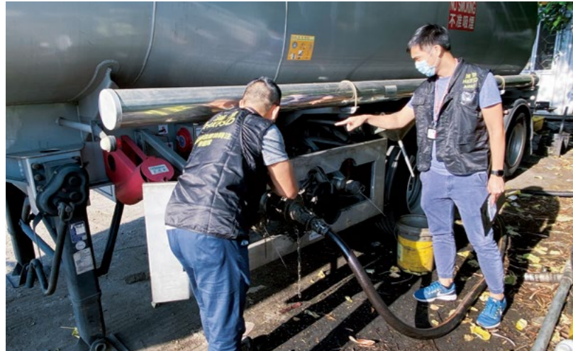
a 打擊非法燃油轉注特遣隊搗破非法油站。 The Anti-illicit Fuelling Activities Task Force cracks down an illegal fuel filling station.