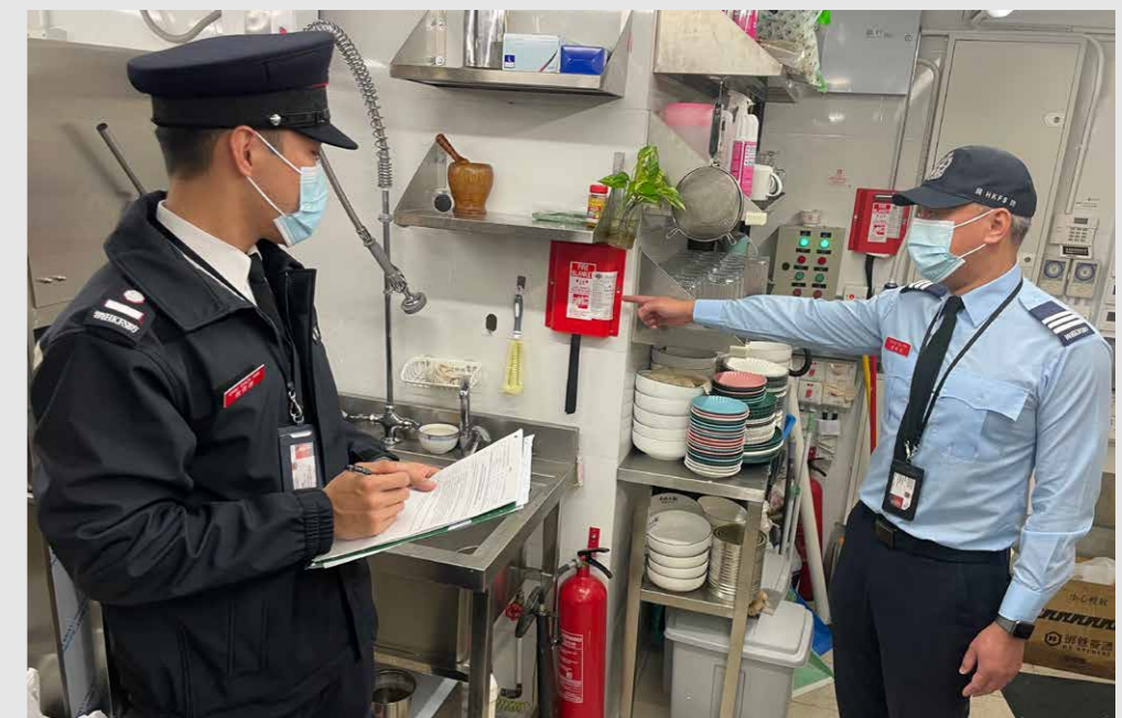
► 消防人員到食肆巡查，確保其消防裝置及設備符合消防規定。Fire personnel inspect a food premises to ensure its FSIs and equipment are in compliance with the fire services requirements.