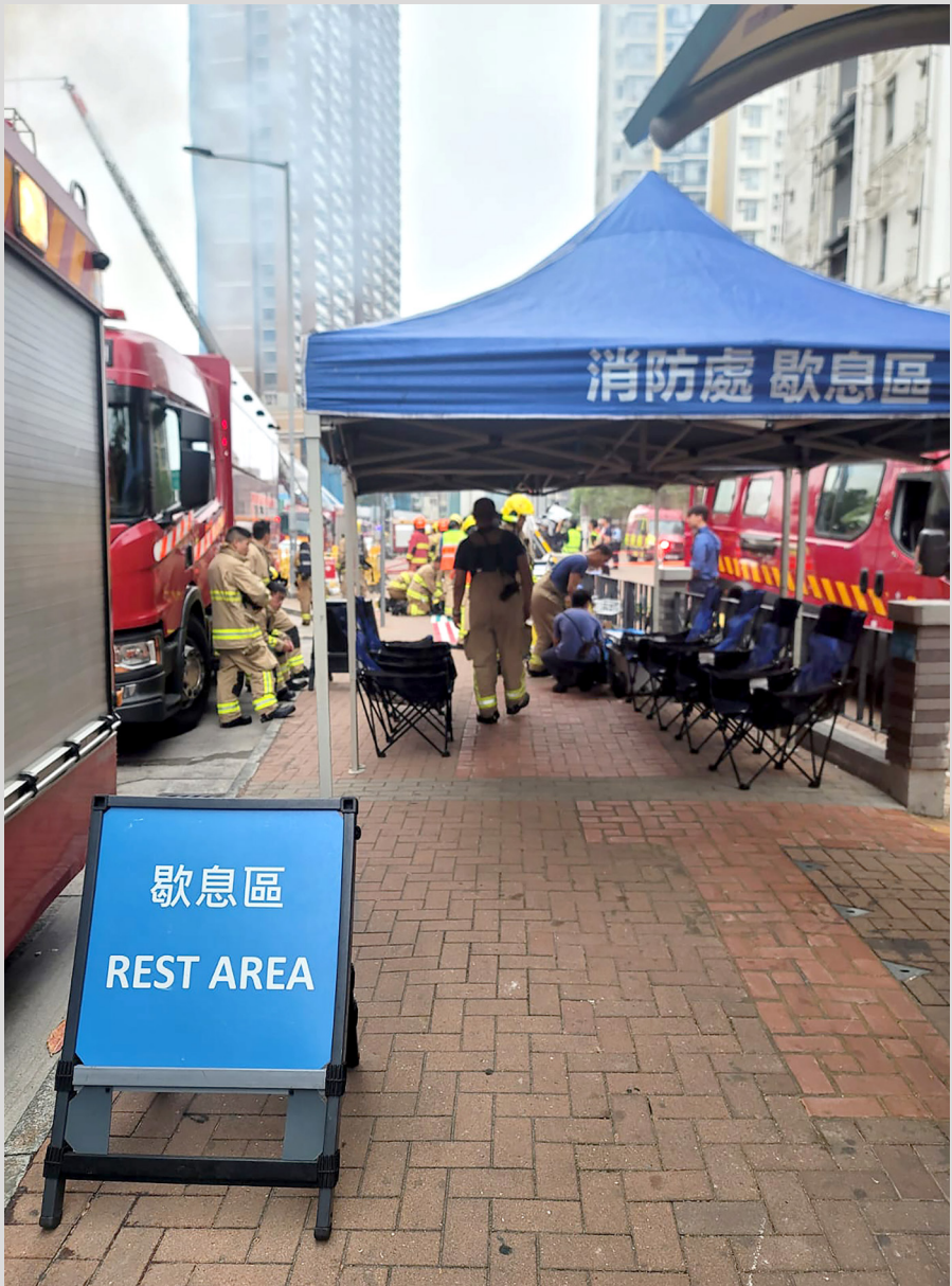
于洪水桥一宗四级火警现场设立的歇息区。 A rest area is set up at the scene of a No. 4 alarm fire in Hung Shui Kiu.

In addition, the division facilitates the establishment of a better safety management system with a view to preventing work injuries and promotion of occupational safety and health. In 2024, rest areas were set up for 10 incidents.