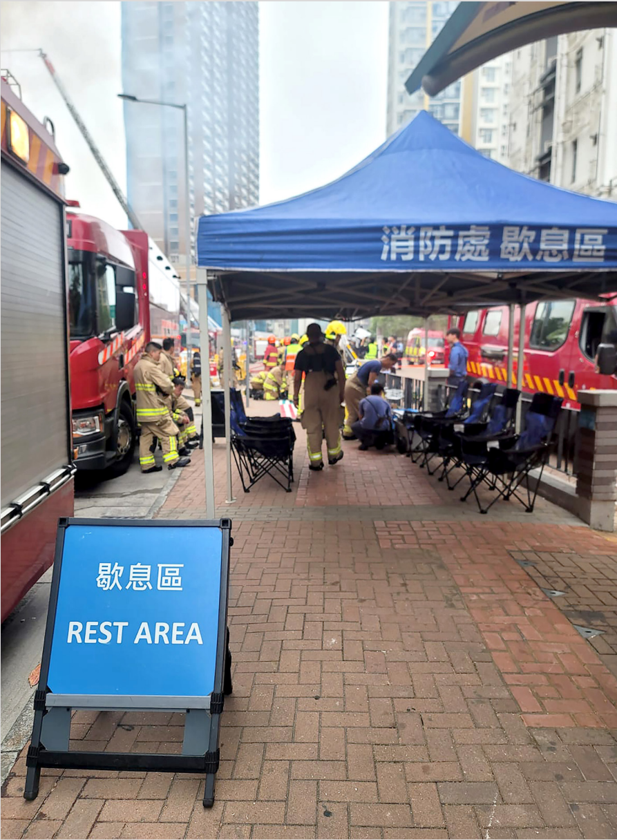
於洪水橋一宗四級火警現場設立的歇息區。 A rest area is set up at the scene of a No. 4 alarm fire in Hung Shui Kiu.

In addition, the division facilitates the establishment of a better safety management system with a view to preventing work injuries and promotion of occupational safety and health. In 2024, rest areas were set up for 10 incidents.