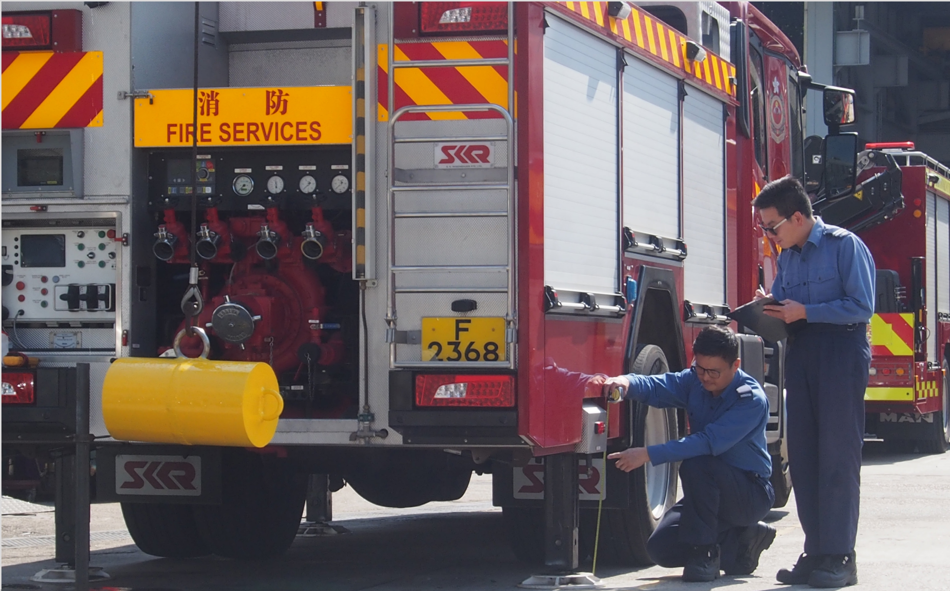
工程及運輸組負責檢查消防車輛。 The Workshops and Transport Division is responsible for the inspection of fire appliances.

The Procurement and Logistics Division is responsible for planning, organising and implementing the department's procurement strategies and policies, as well as actively promoting green procurement to achieve environmental sustainability. It also monitors the expenditure on stores and equipment to ensure the prudent use of public funds.